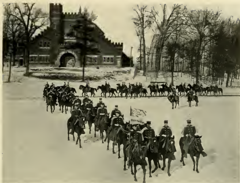
TROOP DRILL IN WINTER AT CULVER MILITARY ACADEMY. COPYRIGHT 1908.