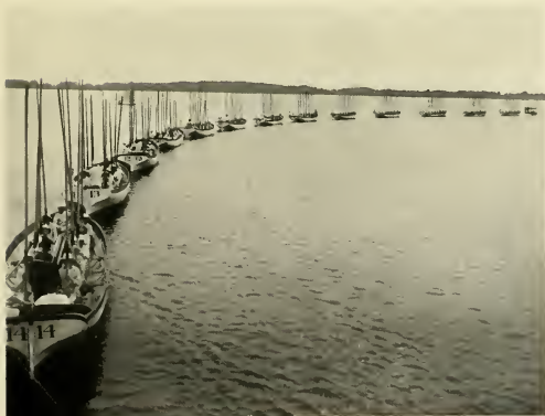
CADETS OF CULVER SUMMER NAVAL SCHOOL AT BOAT DRILL.