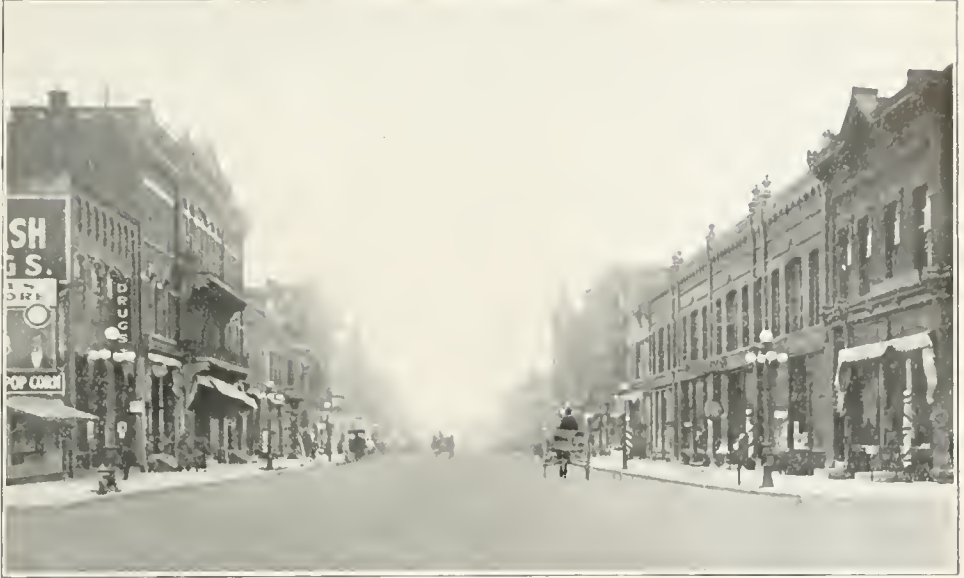
STORY STREET, BOONE