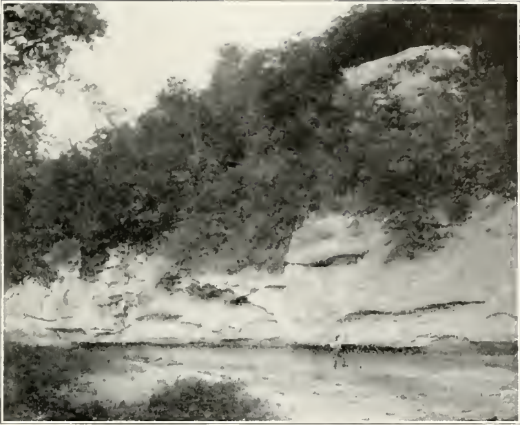
SCENE AT THE LEDGES VALLEY, BOONE