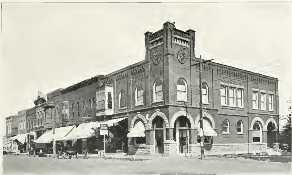
TWO OF OGDEN'S BANK BUILDINGS