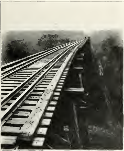
High Bridge, Looking South