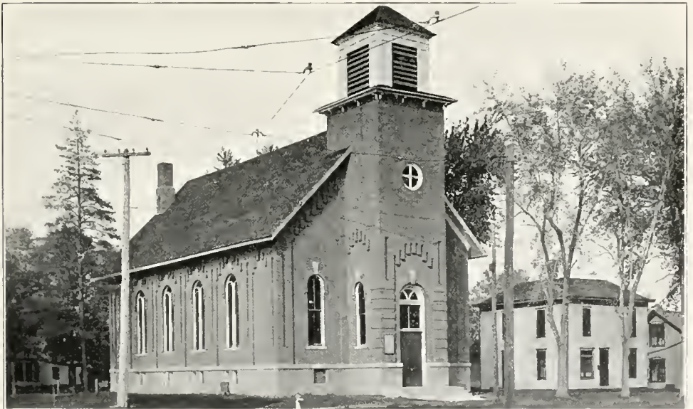
MARION STREET METHODIST EPISCOPAL CHURCH, BOONE