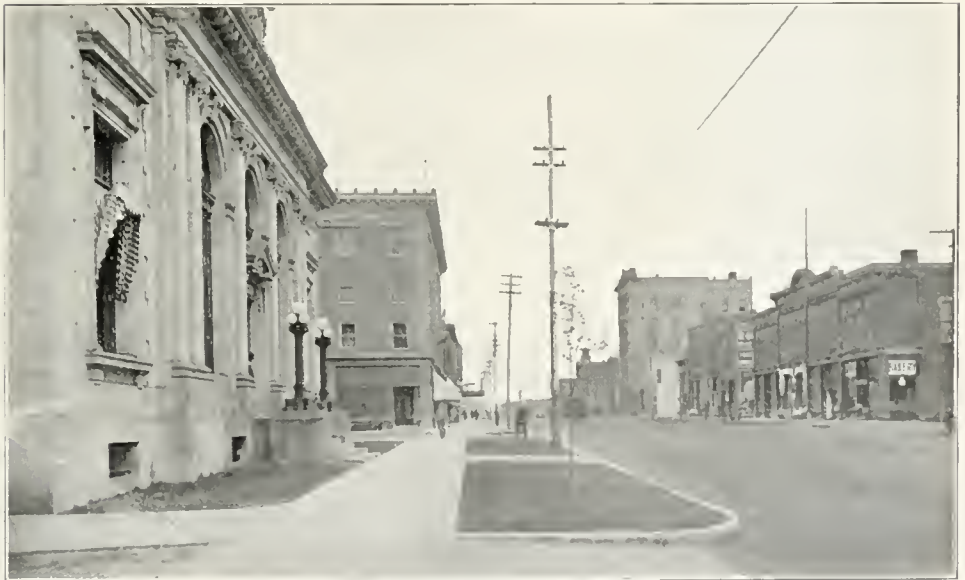
EIGHTH STREET EAST, BOONE