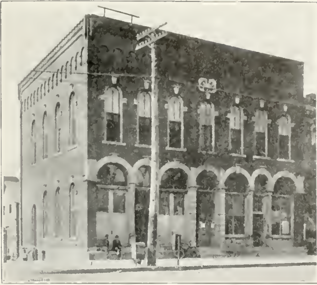
CITY HALL, BOONE