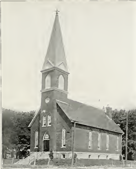
EVANGELICAL LUTHERAN CHURCH, OGDEN