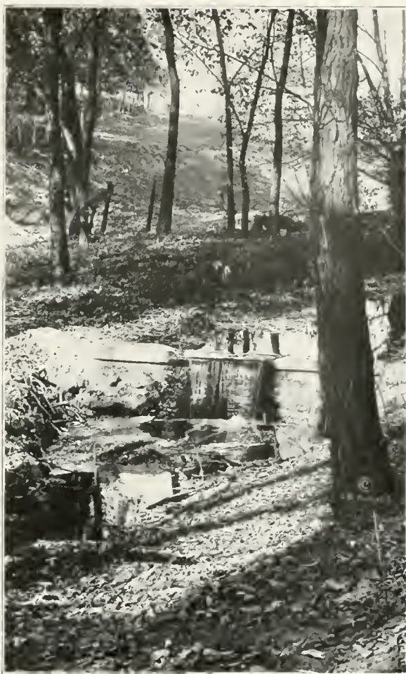
HONEY CREEK, EAST LINWOOD