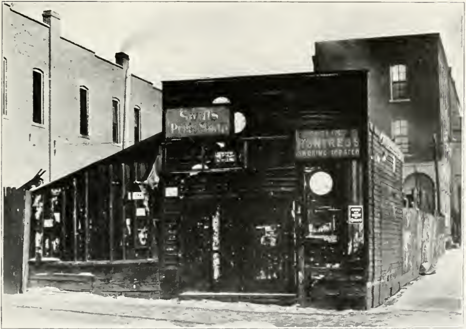
FIRST CITY HALL IN BOONE, DEMOLISHED OCTOBER, 1907