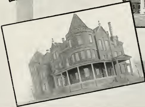
Courthouse Biblical College Eleanore Moore Hospital