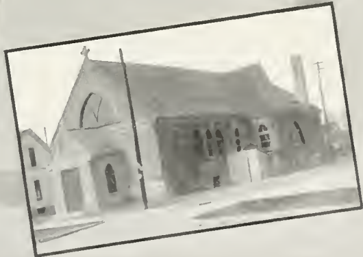
Presbyterian Church Catholic Church First Universalist Church