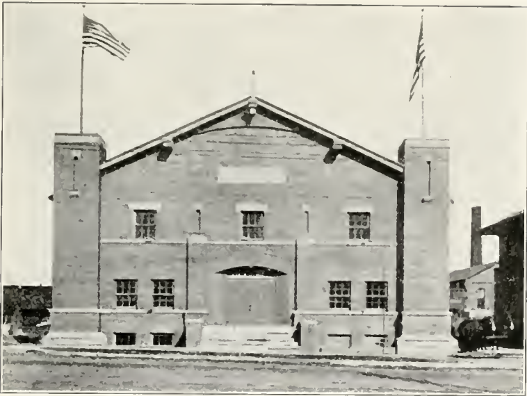
LINCOLN ARMORY, BOONE