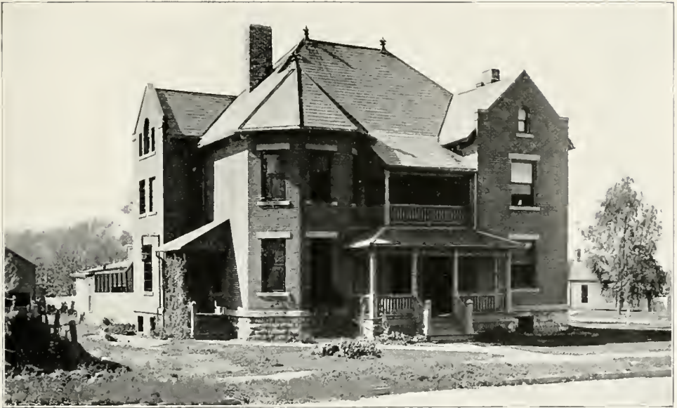
COUNTY JAIL, BOONE