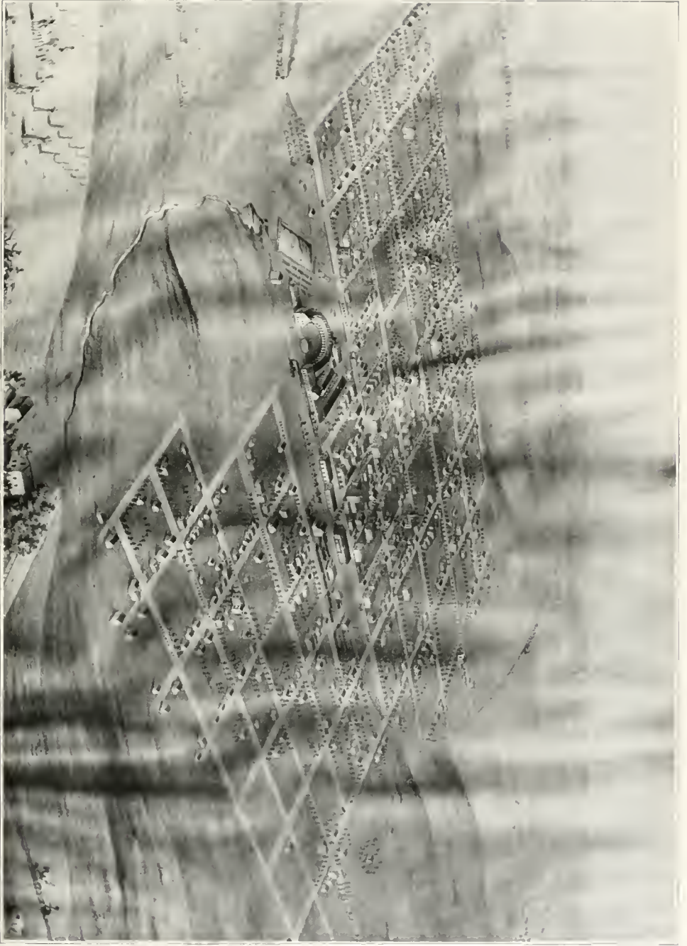
CITY OF MONTANA, NOW BOONE