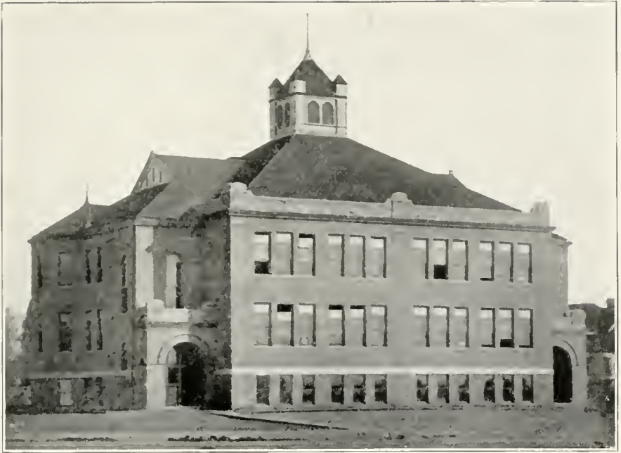
PAGE SCHOOL, BOONE