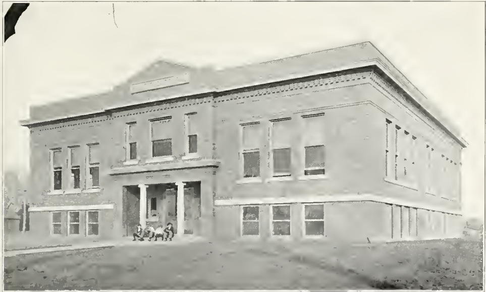
GARFIELD SCHOOL, BOONE