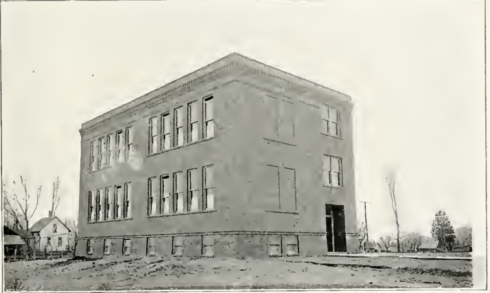
SOUTH SIDE PUBLIC SCHOOL, OGDEN