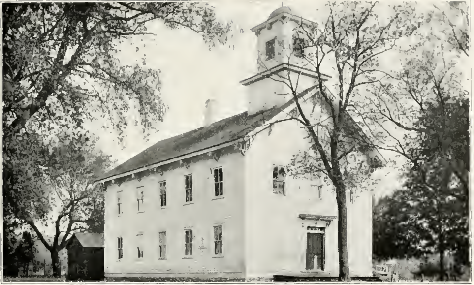
OLD GARFIELD SCHOOL, BOONE