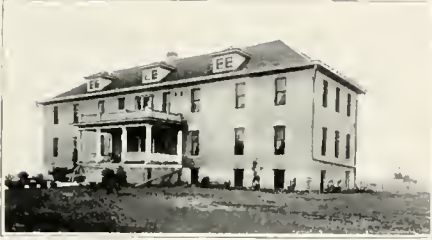
Old People's Home