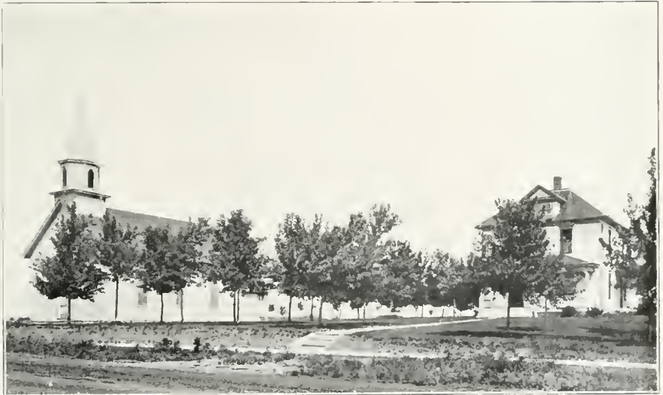
CATHOLIC CHURCH BLOCK, OGDEN