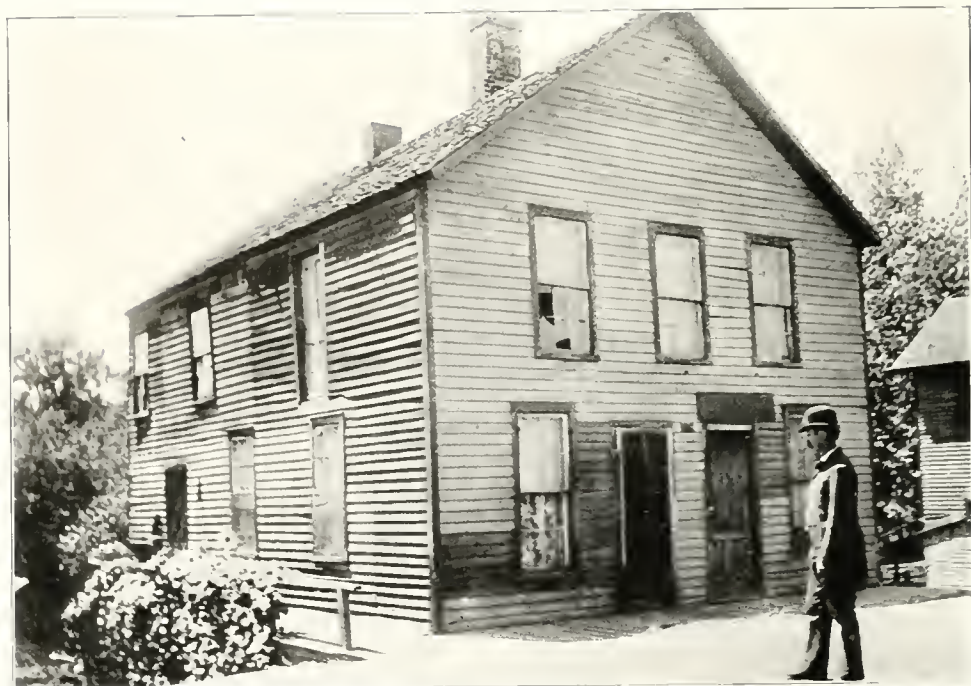
FIRST SCHOOLHOUSE IN BOONE Keeler Street, between Seventh and Eighth