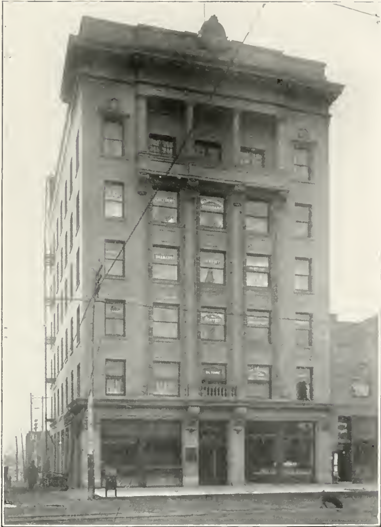
BOONE NATIONAL BANK BUILDING, BOONE, IOWA