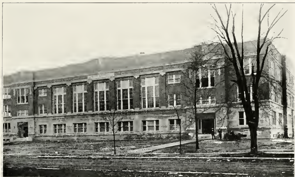
HIGH SCHOOL, BOONE