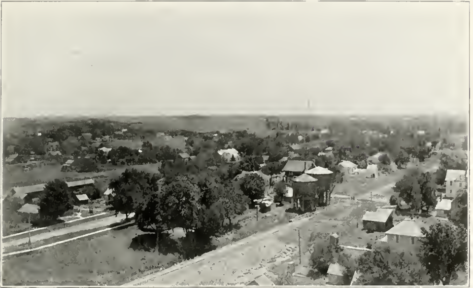
BIRDSEYE VIEW FROM WATER TANK, MADRID