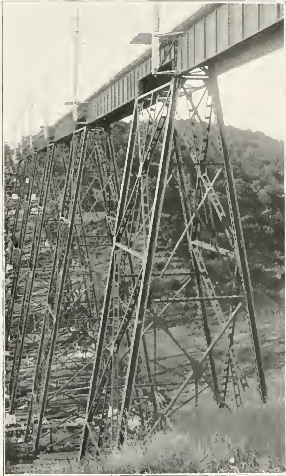
FORT DODGE, DES MOINES & SOUTHERN BRIDGE, NEAR BOONE