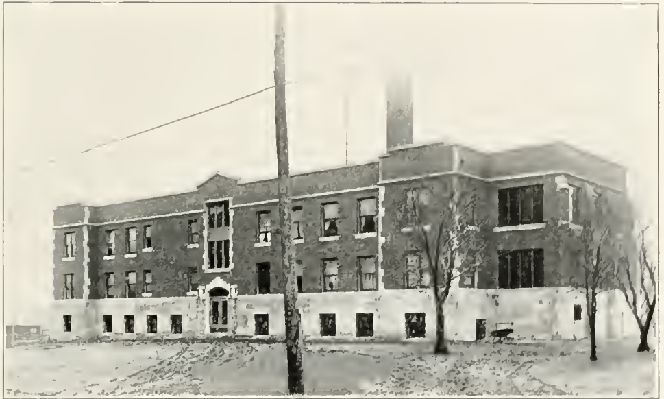
NEW EASTERN STAR HOME, BOONE