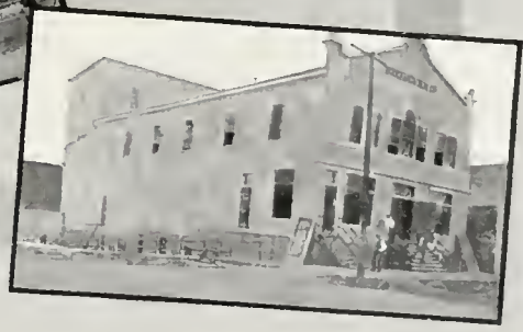
New Bank Building State Bank Methodist Episcopal Church