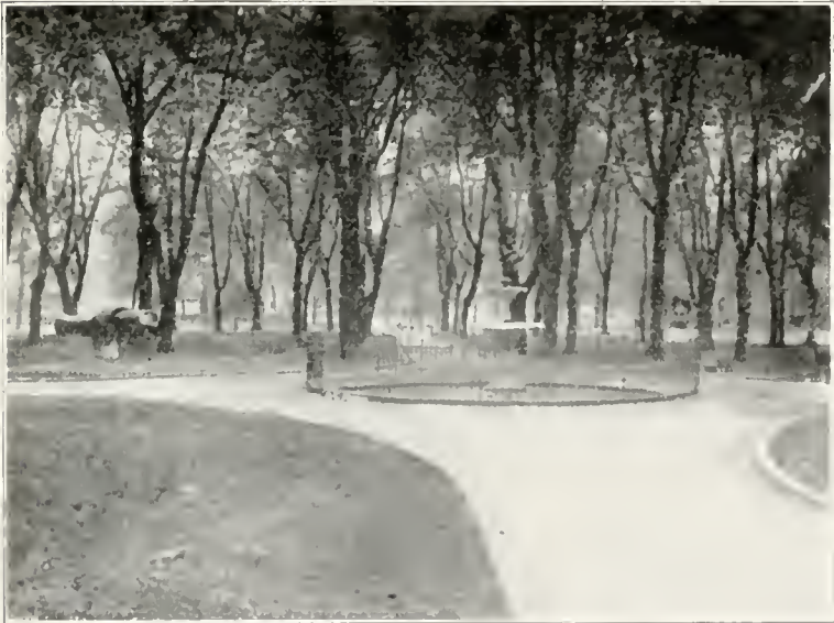
THE CITY PARK, BOONE