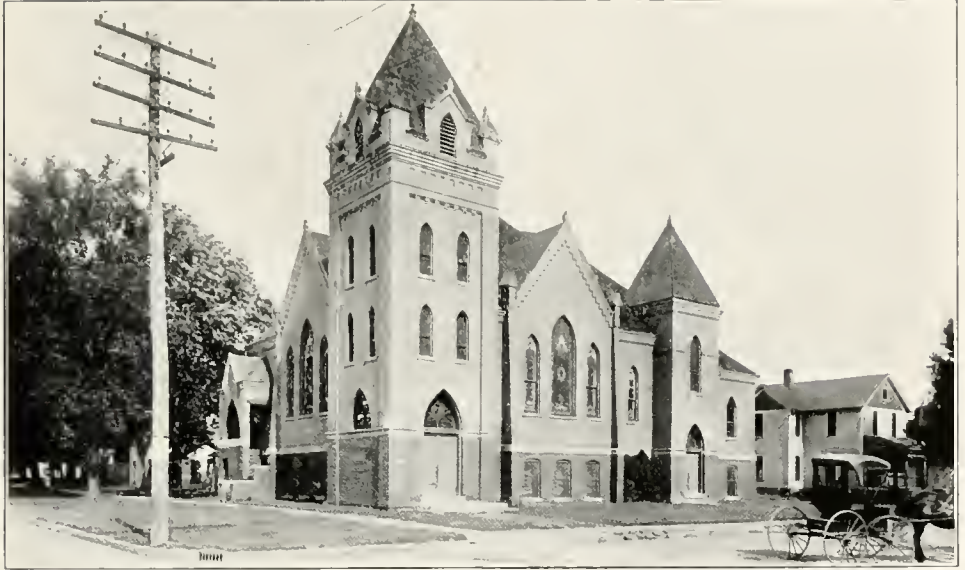
CHRISTIAN CHURCH, BOONE