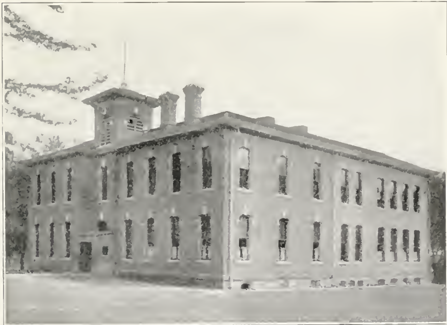
LOWELL SCHOOL, BOONE