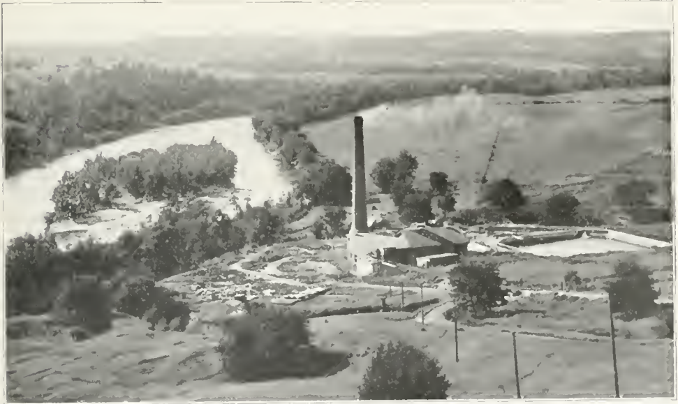
WATERWORKS, RIVER STATION, BOONE