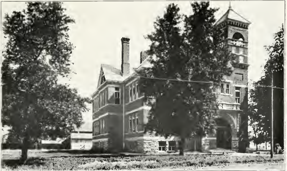
HIGH SCHOOL, OGDEN