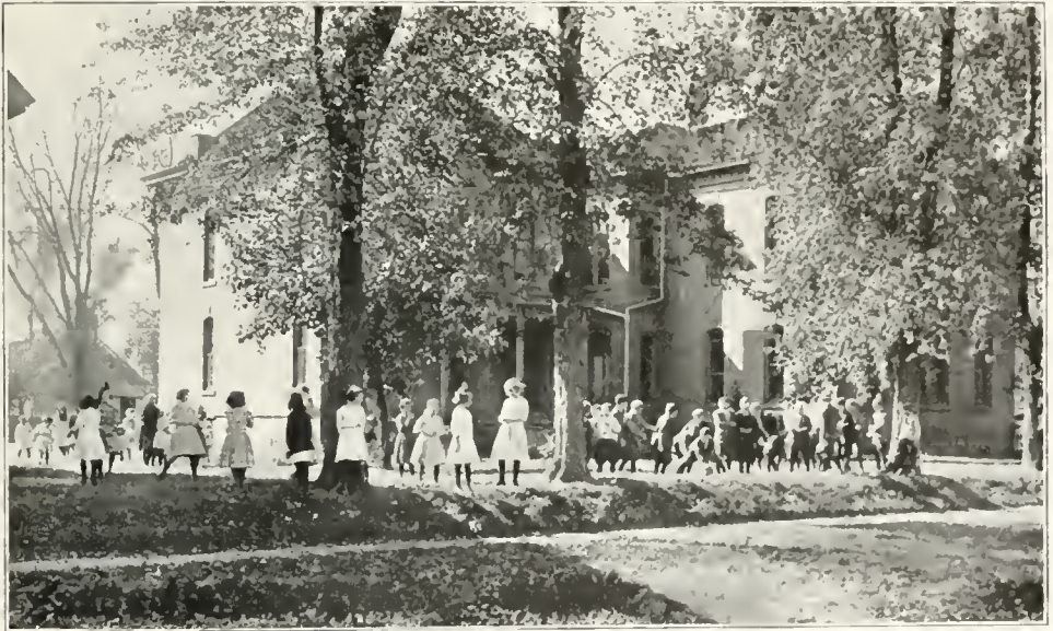
SACRED HEART SCHOOL, BOONE