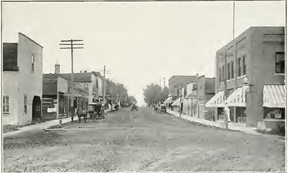
STATE STREET, MADRID