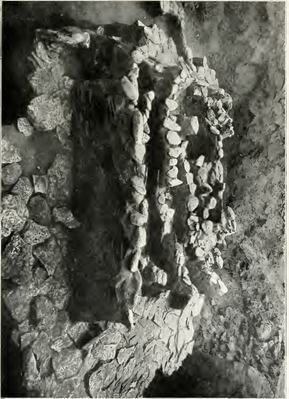
INDIAN MOUND UNCOVERED IN BOONE COUNTY FOUR MILES SOUTHWEST OF BOONE