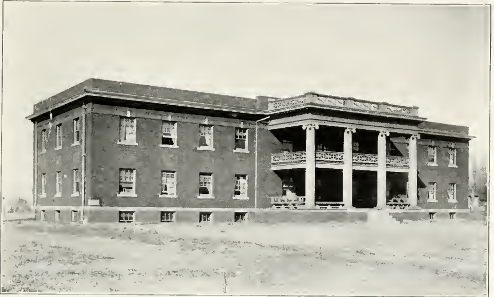
SWEDISH OLD PEOPLE'S HOME, BOONE