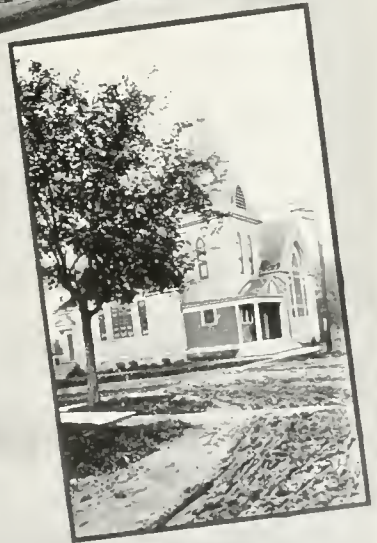
Swedish Free Church