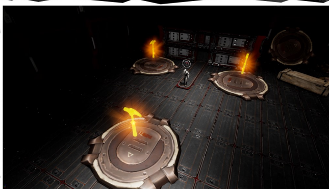
BUILD AND UPGRADE AUTOMATIC TURRETS