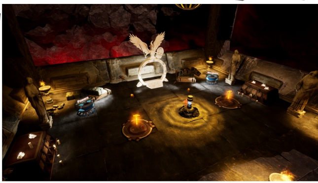
DEFEND YOUR ONLY WAY HOME

PLAY AS A MEMBER OF THE ELITE GROUP " OVERKILL UNIT " AND SHOOT YOUR WAY INTO HORDES OF ENEMIES. FROM TINY SKELETONS TO GIGANTIC DEMONS. TO PROTECT INTERDIMENSIONAL PORTALS WHICH ARE AT THE SAME TIME YOUR WAY HOME AND A WAY FOR THE MONSTERS TO INVAD YOUR WORLD! YOU CAN COUNT ON YOUR MILITARY ARSENAL TO FIGHT. BE IT LOADS OF DIFFERENT WEAPONS OR AUTOMATIC TURRETS THAT YOU CAN BUILD AROUND THE MAP TO AVOID GETTING OVERWHELMED. BUT YOU WILL HAVE TO PROTECT THEM AS MUCH AS THEY ARE PROTECTING YOU. HOW LONG CAN YOU LAST ?