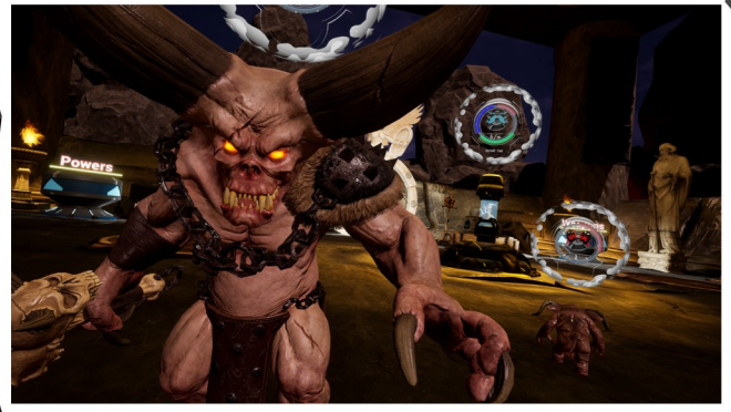
FIGHT ENDLESS HORDS OF ENEMIES