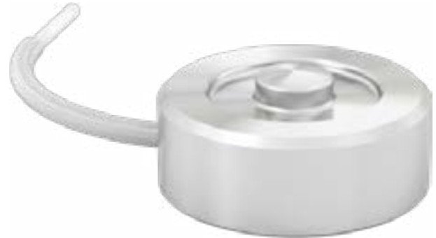
Model LBM-5K (Shown)