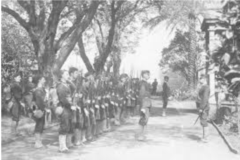
Troops from the USS Boston Honolulu January 17, 1893

i By 1887, Hawai'i had treaties and conventions with Belgium, Bremen, Denmark, France, the German Empire, Great Britain, Hamburg, Hong Kong, Italy, Japan, Netherlands, New South Wales, Portugal, Russia, Samoa, Spain, the Swiss Confederation, Sweden and Norway, Tahiti, and the United States. Treaties and Conventions concluded between the Hawaiian Kingdom and Other Powers since 1825 , Elele Book, Card, and Job Print., 1887. See also Stephen Kinzer, Overthrow , Times Books, Henry Holt & Company, New York 2006.