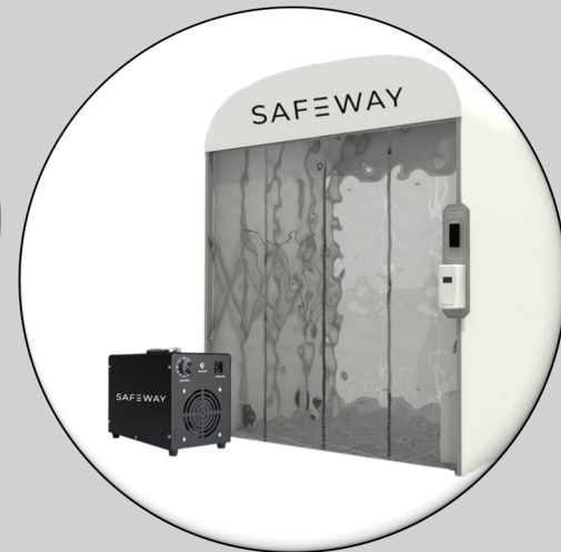
Ozone & UV-C Disinfection of Spaces