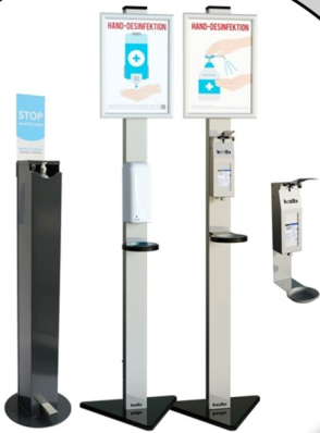
Dispensers & Sanitisers for Hands & Surfaces