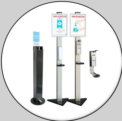
Dispensers & Sanitisers for Hands & Surfaces