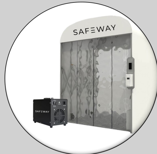
Ozone & UV-C Disinfection of Spaces