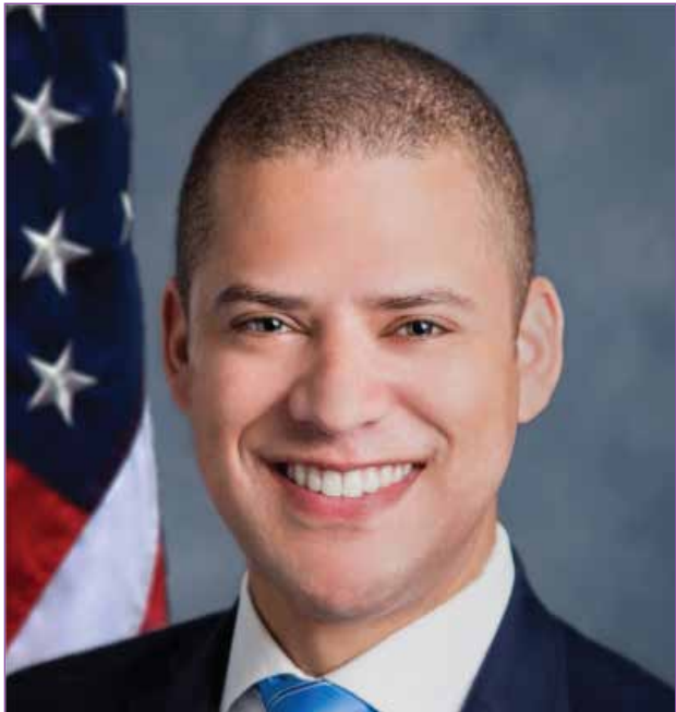
By David Tores City of Montebello Mayor Pro Tem

It's a question you'll likely start asking and answering in 2022.