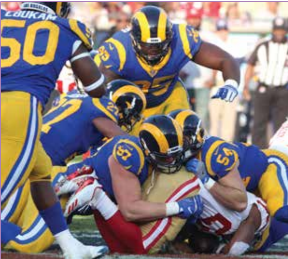
Los Angeles Rams Defense was ranked number 1 in the league in 2020 and they will try to repeat the 2021 season using the same mentality and determination and swarming defense from 2020.