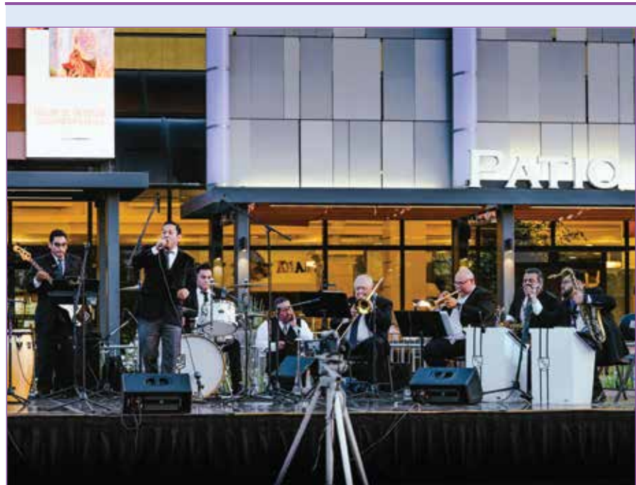
DRIVE-IN CONCERTS AT THE SHOPS