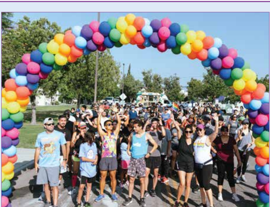
STRIDE FOR PRIDE - 5K WALK/RUN