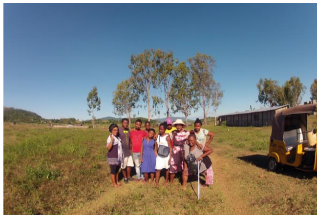
Staff & parents on our newly purchased land

By creating the first facility on the island, The Sunrise Centre , Learn Achieve Become / Sunrise Madagascar shall be fulfilling the right to an education whilst providing daily care & support for up-to 40 young people with various physical & intellectual difficulties. The Sunrise Centre shall also help to lift local adults with disabilities & the family members of students out of poverty by providing employment initiatives & respite.