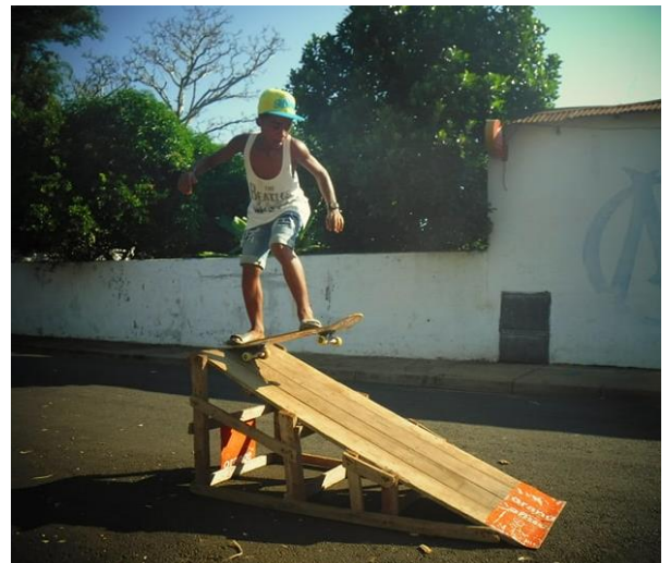
A student learning to skateboard in 2017