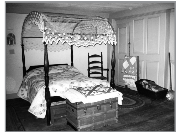
THE WEST CHAMBER