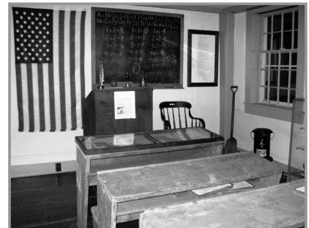
THE CHILDREN'S ROOM