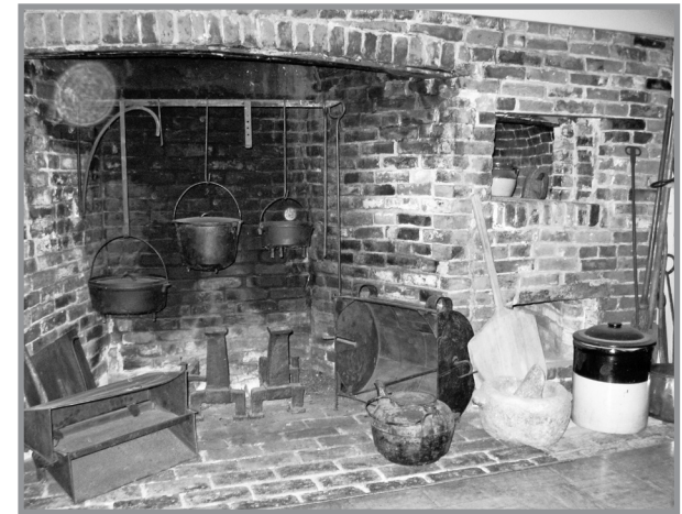
THE KITCHEN FIREPLACE

In 1967 the homestead was sold to Honeywell Corp. To insure the preservation of this historic house, Honeywell deeded it to the Marlborough Historical Society. This generous gift is the spark that has helped our Society grow from an original membership of about twenty-five people.