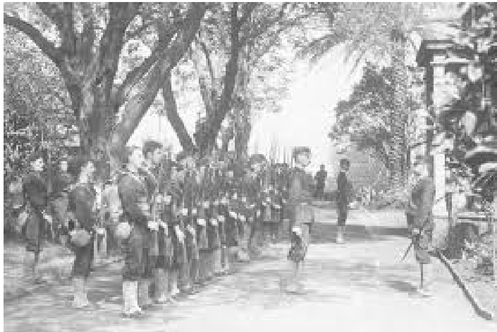
Troops from the USS Boston Honolulu January 17, 1893