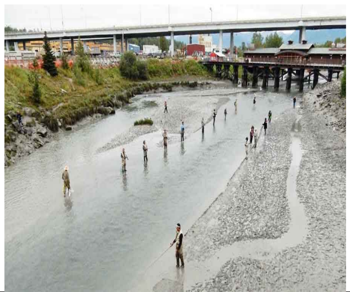
In the city, the Ship Creek is a very popular place to fish for salmon at high or low tide