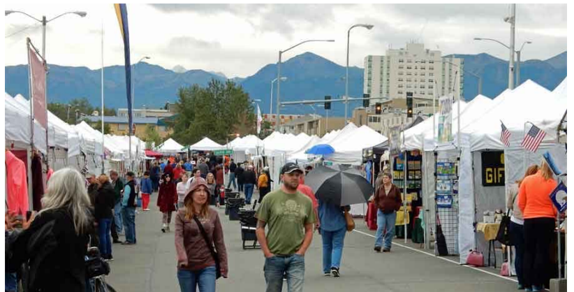
An open market exists in the downtown with artists, crafts and food