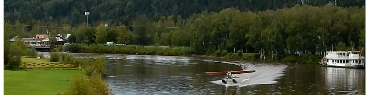
Small aircraft are common in Alaska as a means of travel.