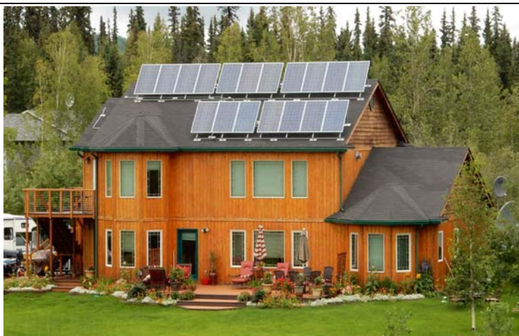
An amazing style of homes for year-long living along the river.