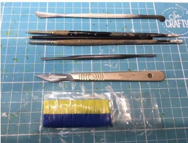
The tools required for sculpting a miniature.

If you have always wanted to see a particular miniature made then we can do that for you. The miniature can be made exactly to your specifications. You have full control over the subject matter, the pose, the details and the scale of the finished figure.