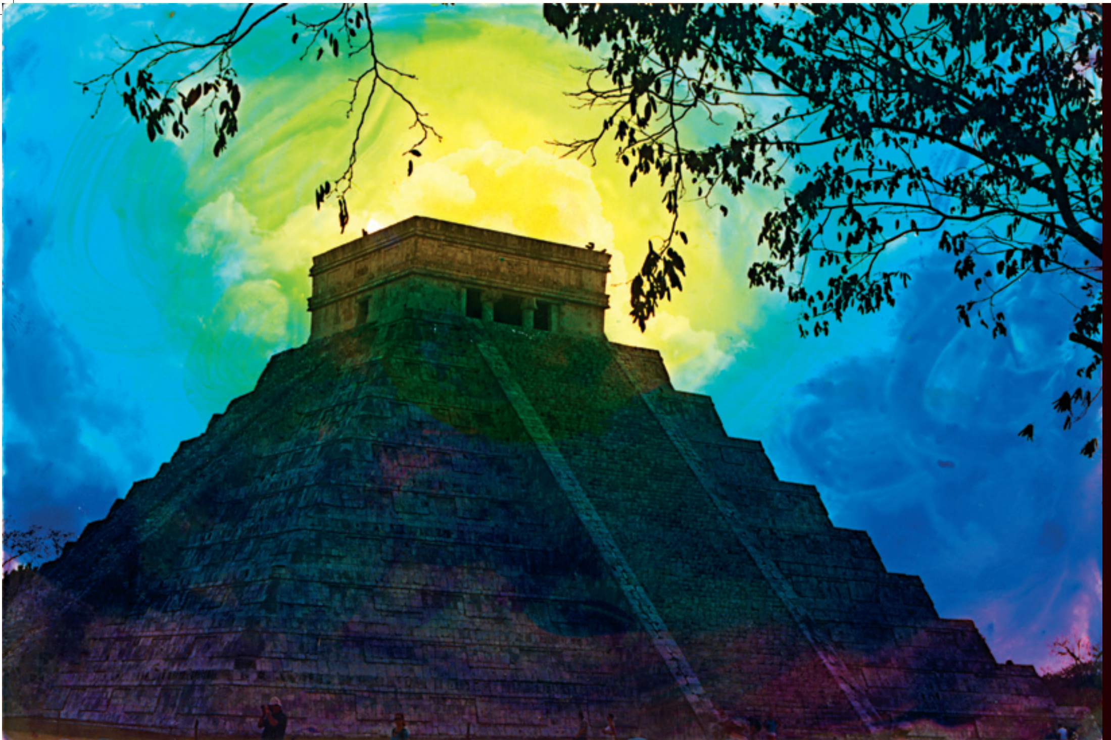
Life and Death 3 · painted photograph on diasec · 60 x 90 cm · 2010