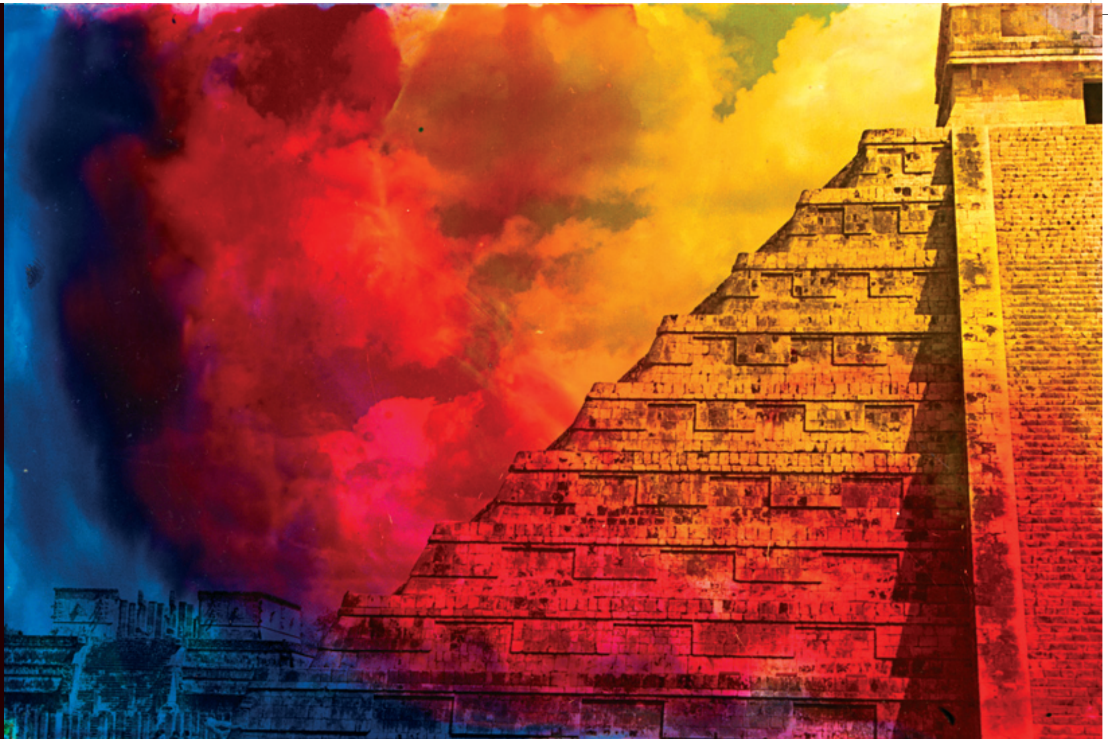
Life and Death 4 · painted photograph on diasec · 60 x 90 cm · 2010