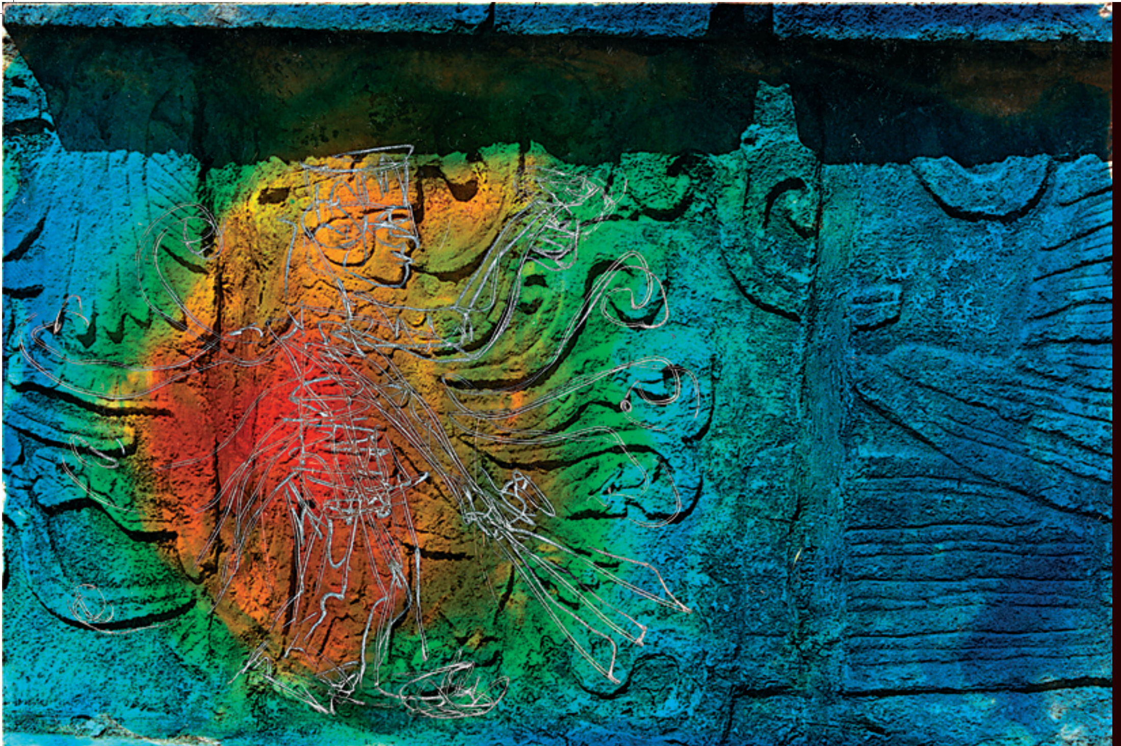
Life and Death 9 · painted photograph on diasec · 60 x 90 cm · 2010