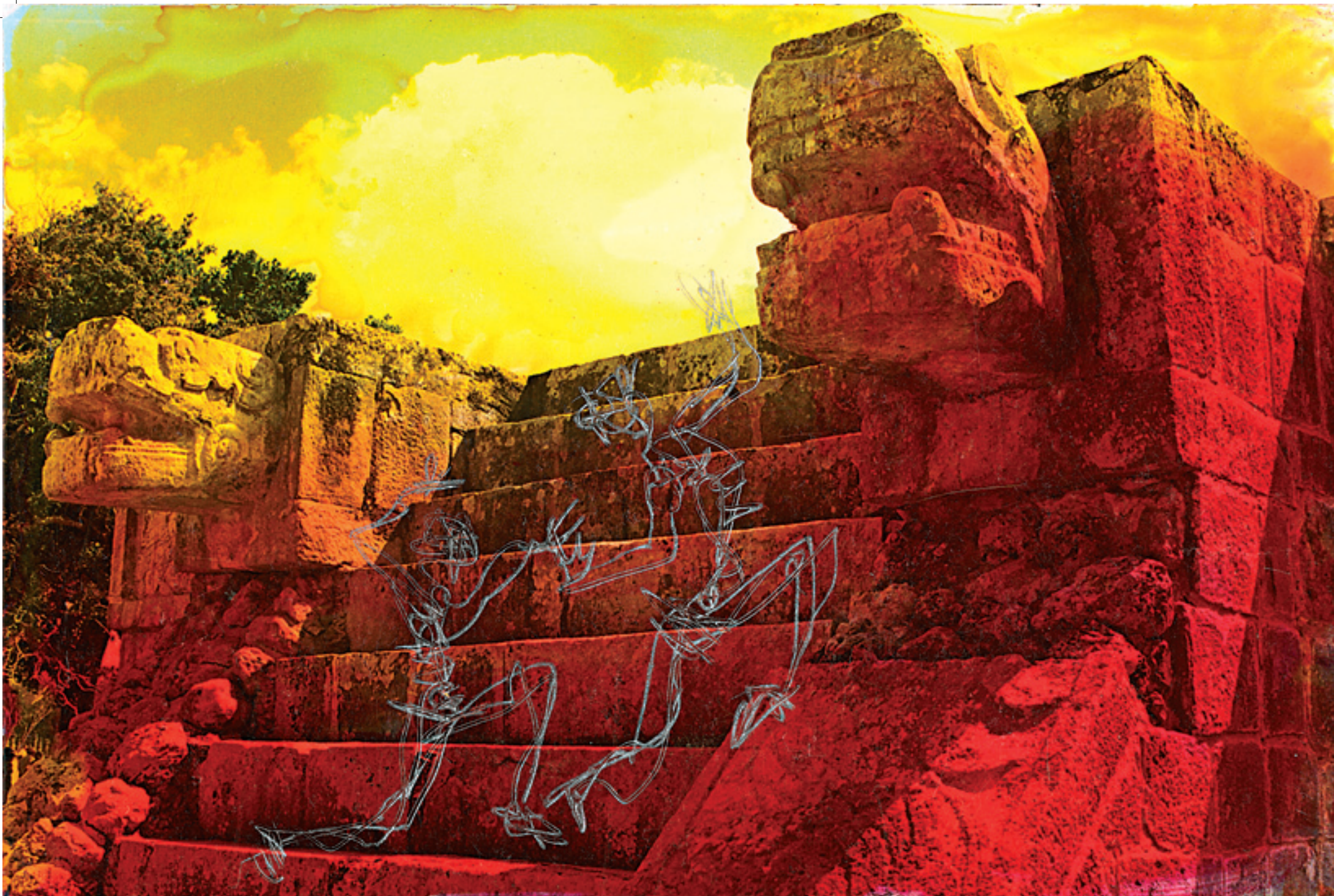
Life and Death 13 · painted photograph on diasec · 60 x 90 cm · 2010