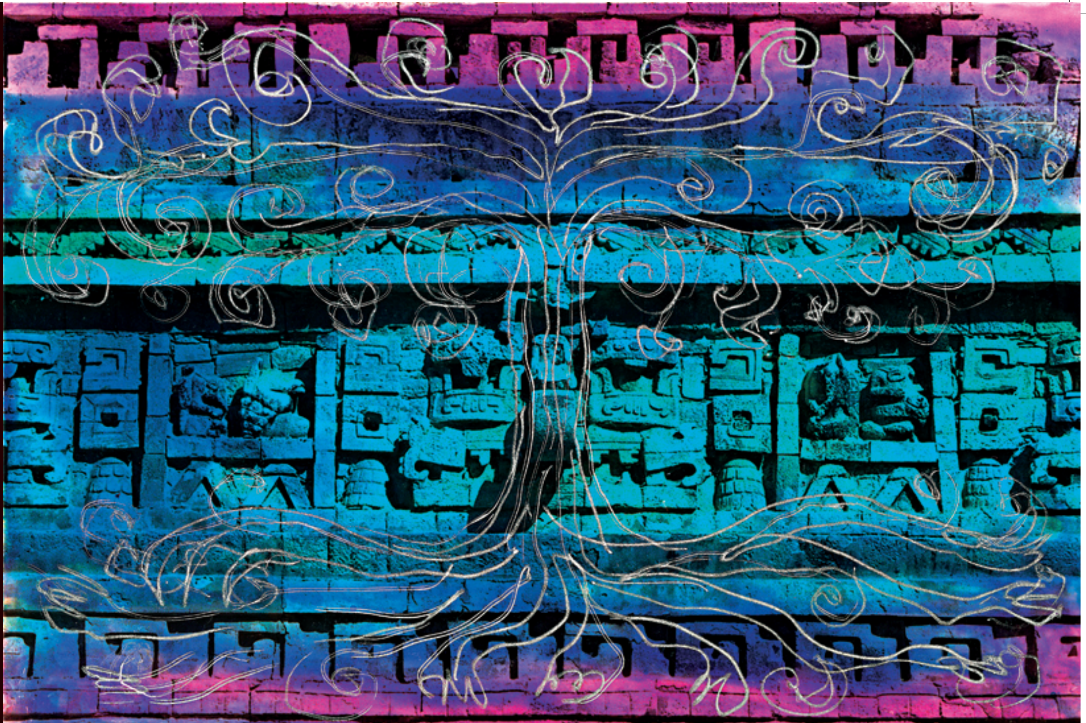
Life and Death 8 · painted photograph on diasec · 60 x 90 cm · 2010