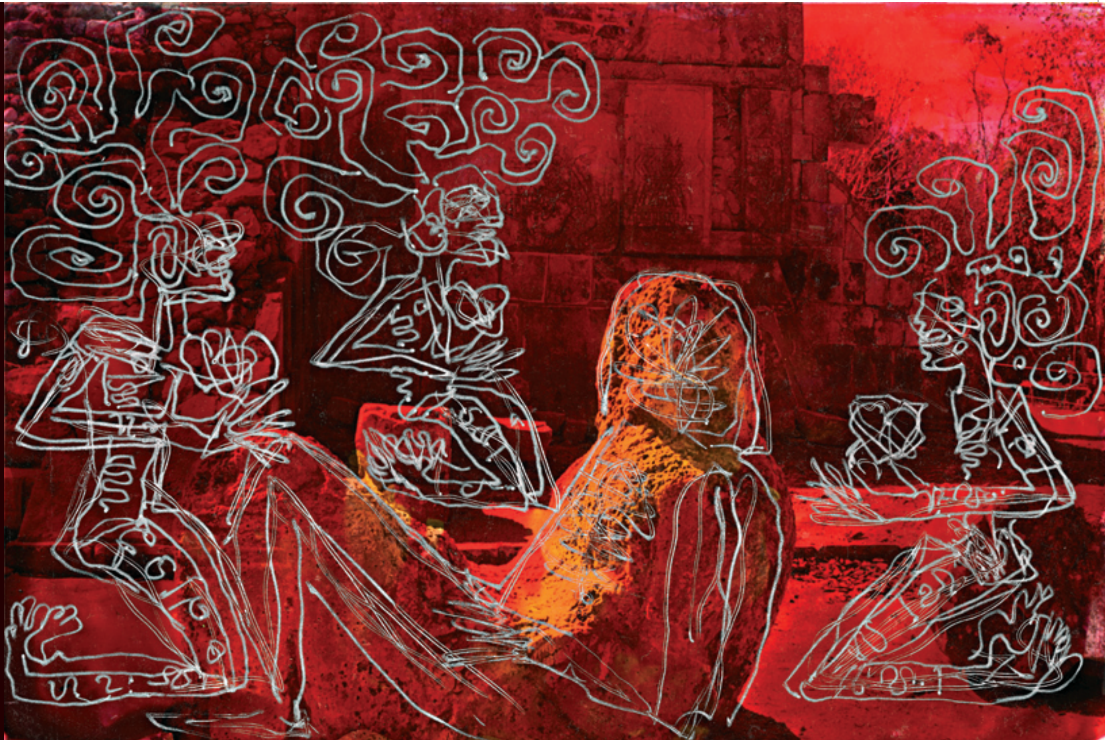
Life and Death 12 · painted photograph on diasec · 60 x 90 cm · 2010