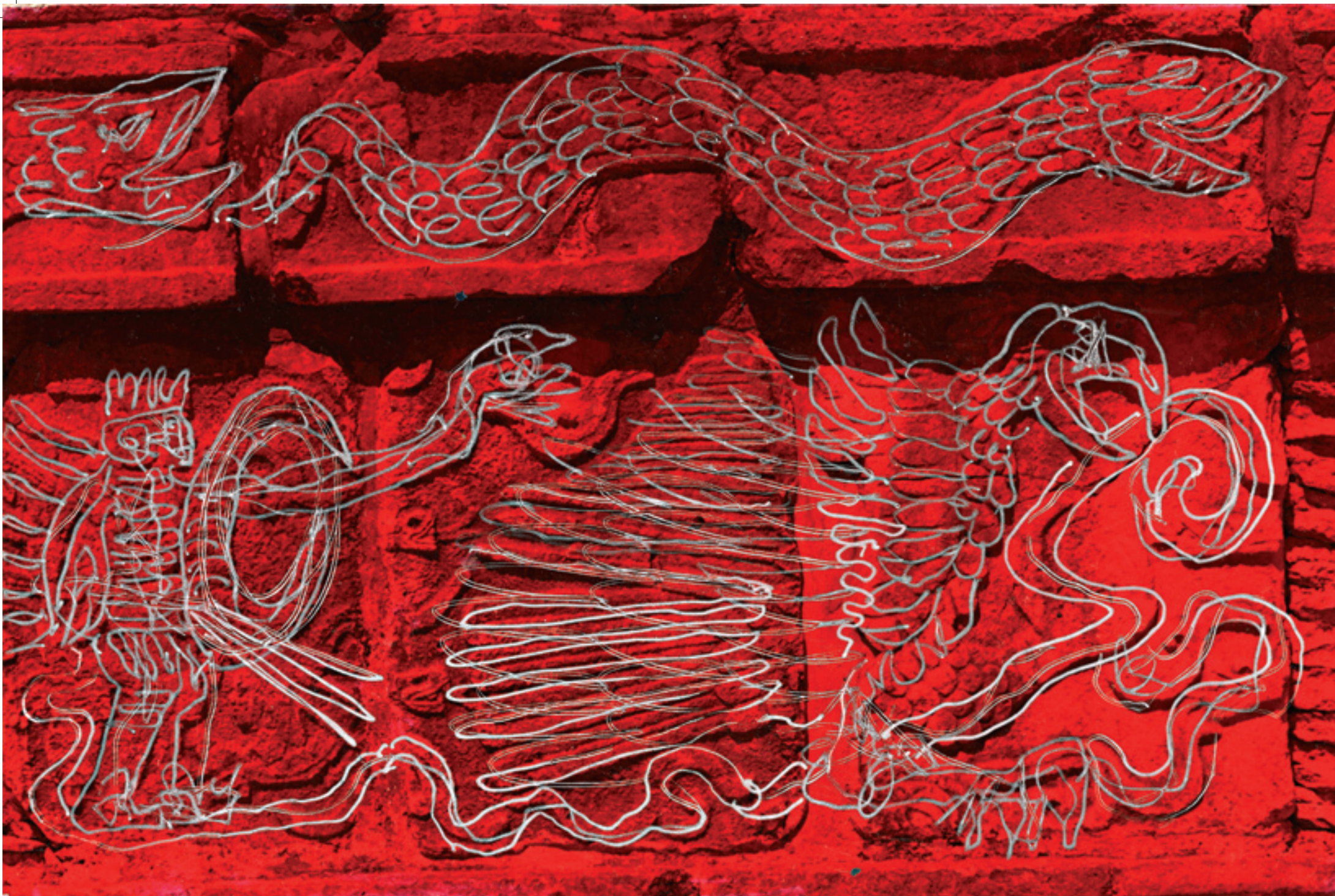
Life and Death 11 · painted photograph on diasec · 60 x 90 cm · 2010