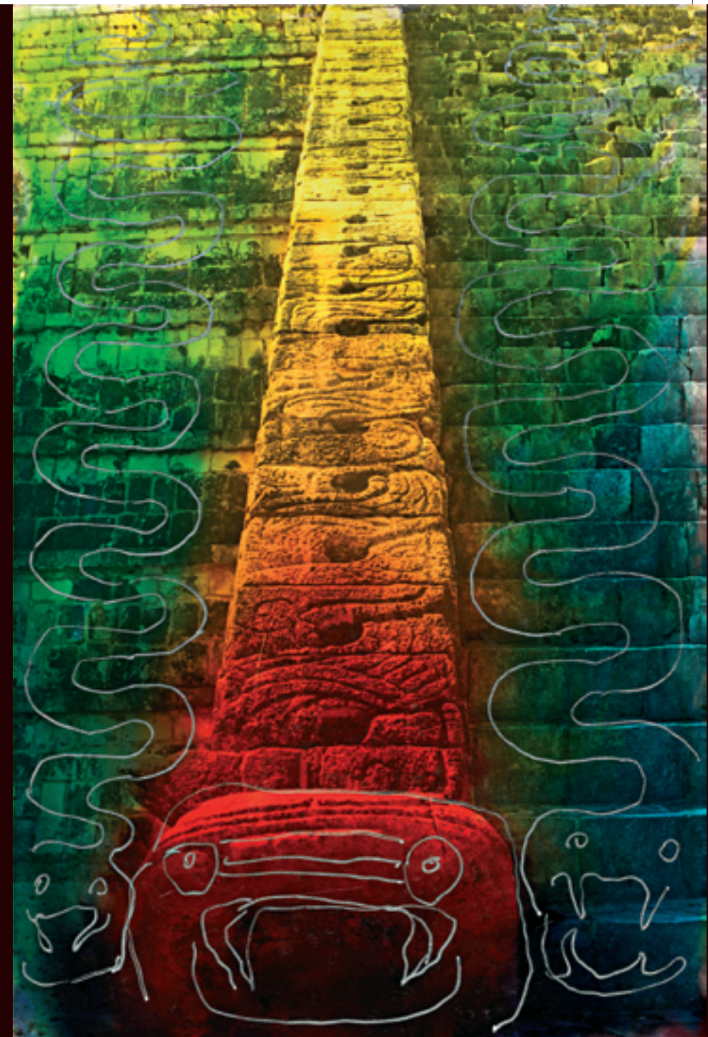
Life and Death 2 · painted photograph on diasec · 90 x 60 cm · 2010