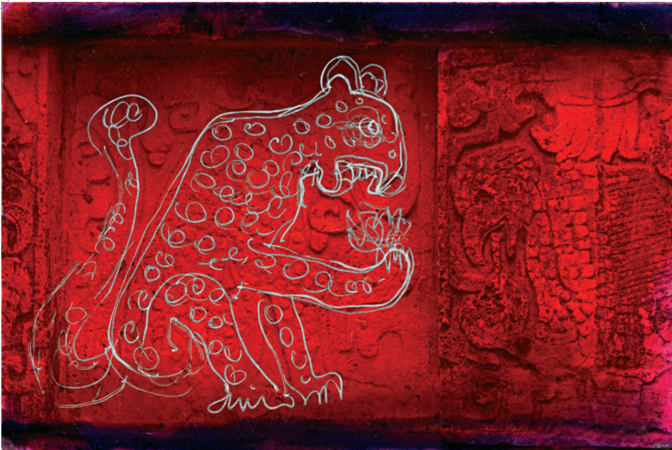
Life and Death 7 · painted photograph on diasec · 60 x 90 cm · 2010