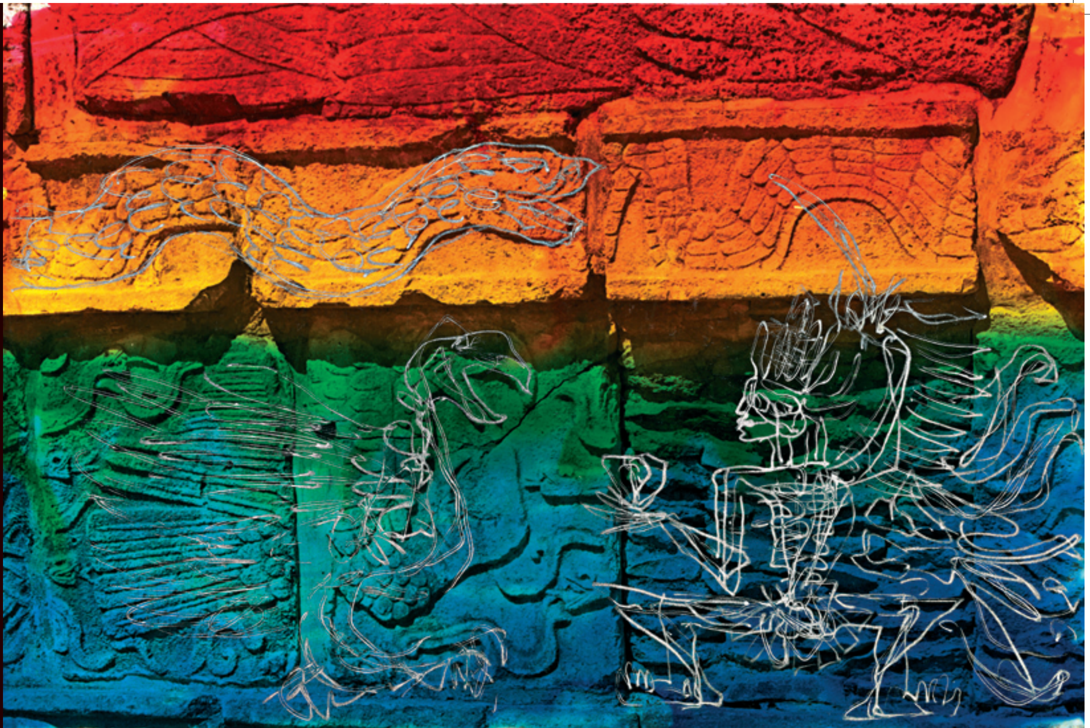
Life and Death 10 · painted photograph on diasec · 60 x 90 cm · 2010