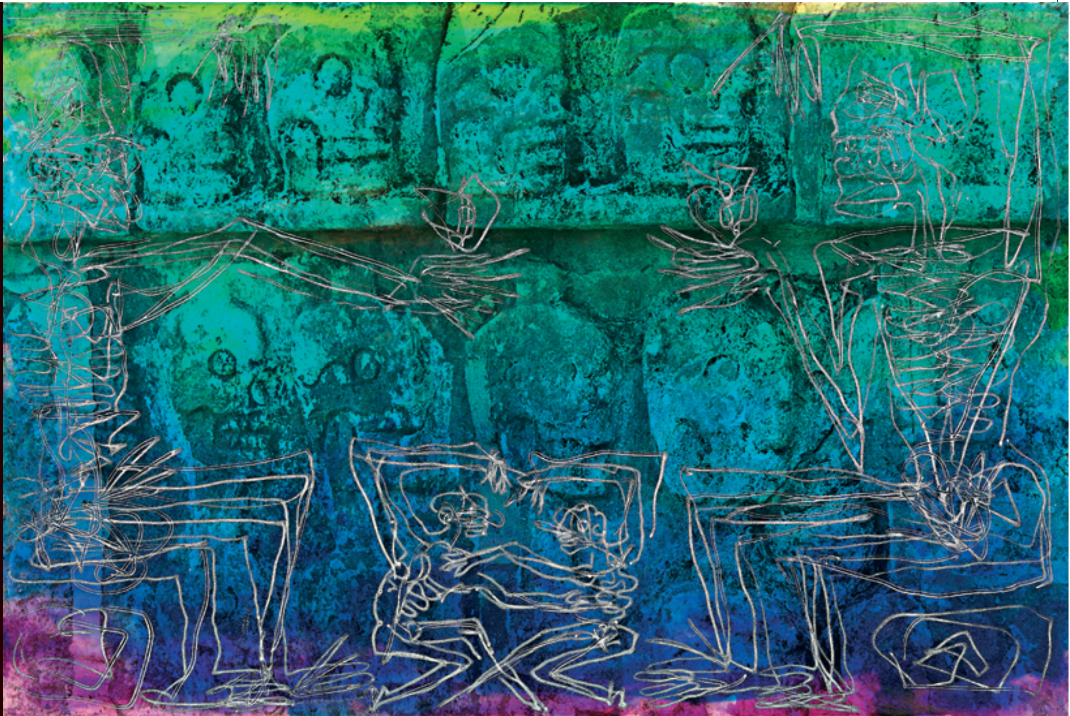
Life and Death 6 · painted photograph on diasec · 60 x 90 cm · 2010