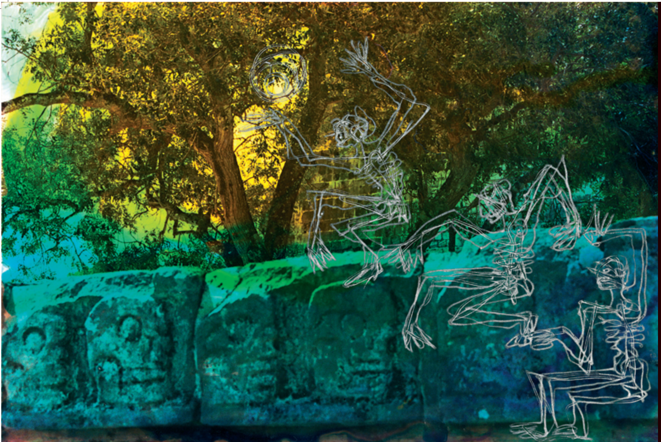
Life and Death 5 · painted photograph on diasec · 60 x 90 cm · 2010