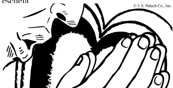
© J. S. Patuch Co., Inc.

El grupo de oración en español les invitan que vengan a participar en las alabanzas de Dios: canten, oren y de su testimonio. Cada viernes de las siete a nueve de la noche en la escuela