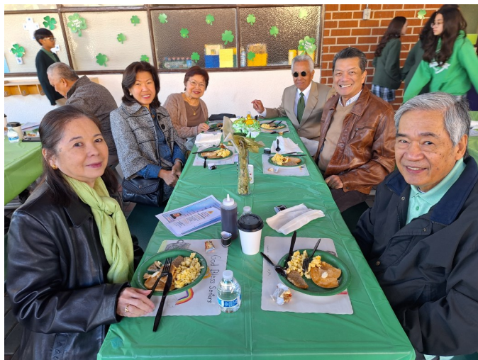
The Junior High students of Holy Trinity School hosted a delicious breakfast in appreciation to our amazing seniors. We thank our seniors for continued prayers and support of our parish school.