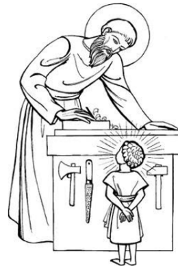
St. Joseph Litany – Guardian of the Redeemer

Tools to grow spiritually in the Year of St. Joseph (Dec 8, 2020 – Dec 8, 2021)