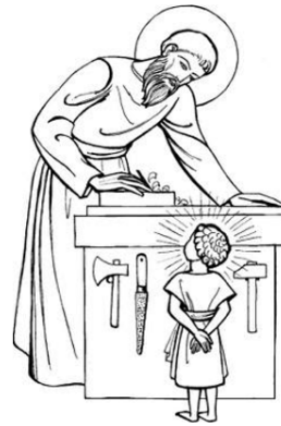
St. Joseph – An example of Humility

Tools to grow spiritually in the Year of St. Joseph (Dec 8, 2020 – Dec 8, 2021)