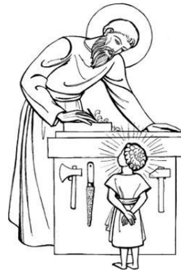
Zealous Defender of Christ – Saint Joseph

Tools to grow spiritually in the Year of St. Joseph (Dec 8, 2020 – Dec 8, 2021)