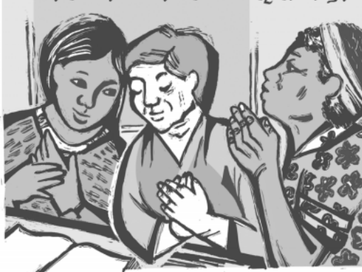
© 2006 J. S. Paluch Company, Inc.

God hears those who call out day and night