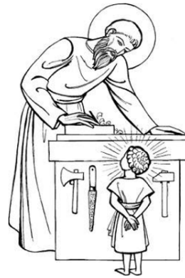
The rise of Josephology

Tools to grow spiritually in the Year of St. Joseph (Dec 8, 2020 – Dec 8, 2021)