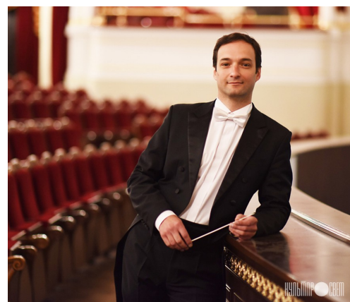
Orchestra « YOUNG BELARUS », Belorussia

Graduated from the Belorussian State Academy of Music in 2004