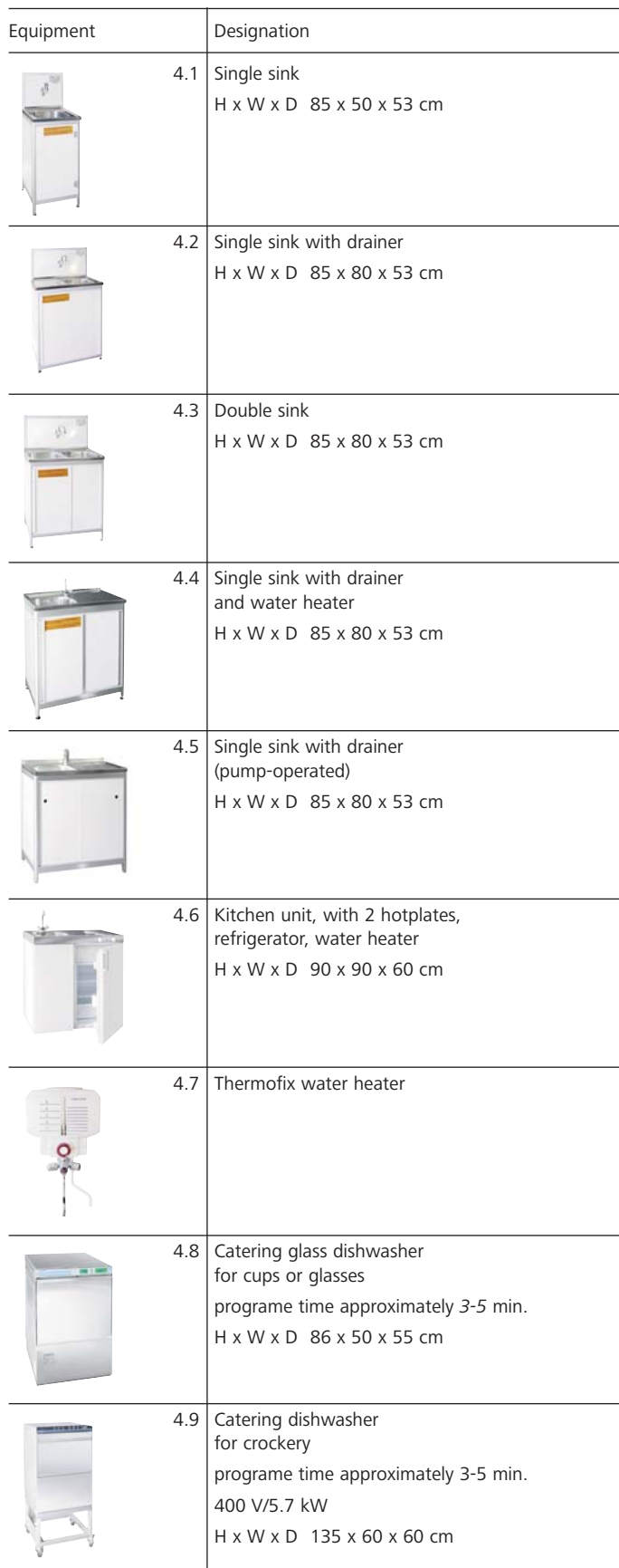
Illustration of rental equipment