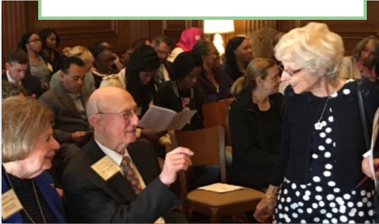
National Capital Lawyers Auxiliary