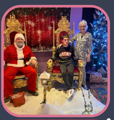
LPH visited Santa!