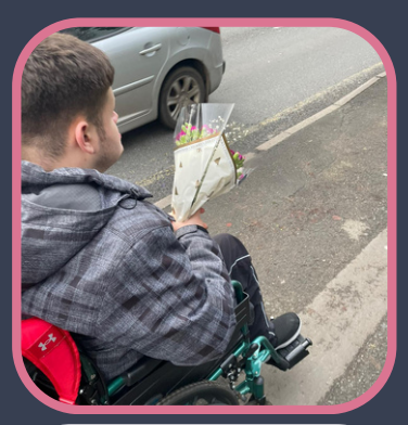
BH treated fellow resident to cheer him up!