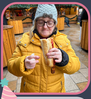
SC loved the Christmas market