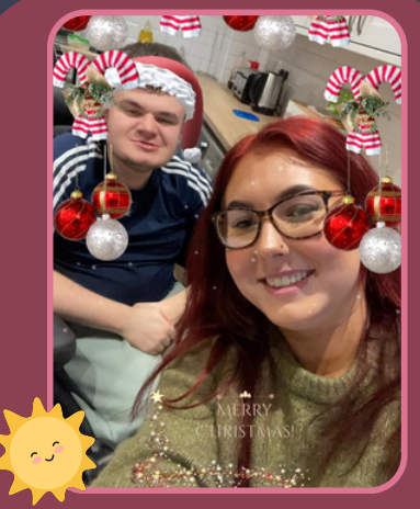
BH is in the festive spirit!