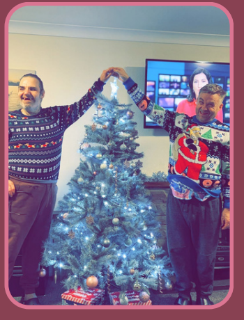
RM + LH decorated a beautiful tree!