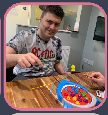
Pre Christmas games