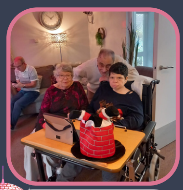
Annual xmas party @ Brooksmead!