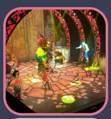
DJD went to see the Panto