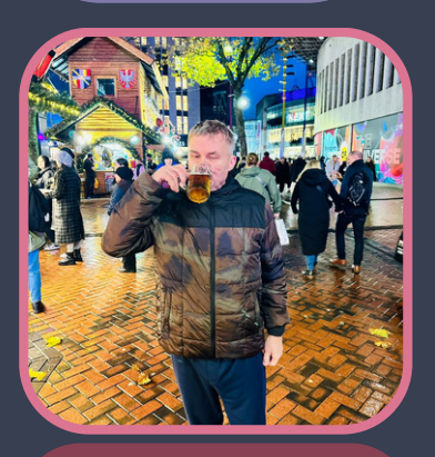
Xmas market must haves