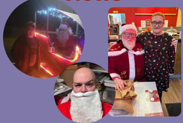
Santa came to visit!