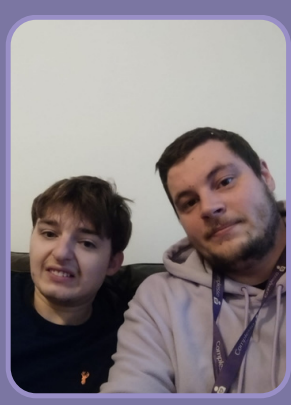
TW is settling in well!