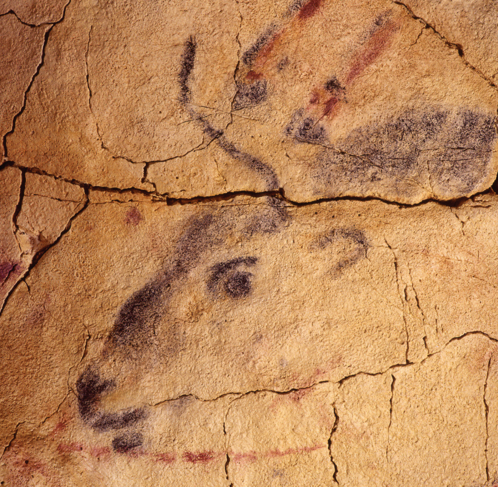
Neocueva cabeza bisonte © Museo Altamira Foto P Saura