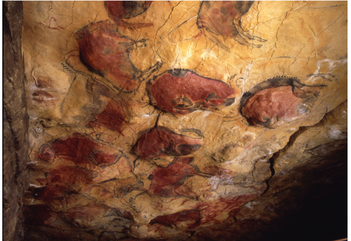
Neocueva Sala Polícromos