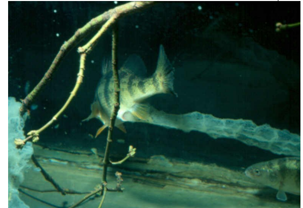
Spawning female yellow perch ( Perca flavescens ) and accompanying male.