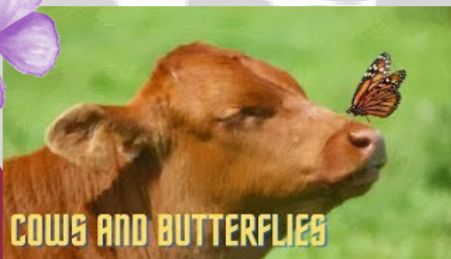
COWS AND BUTTERFLIES

Proceeds benefit Arkansas Valley Hospice