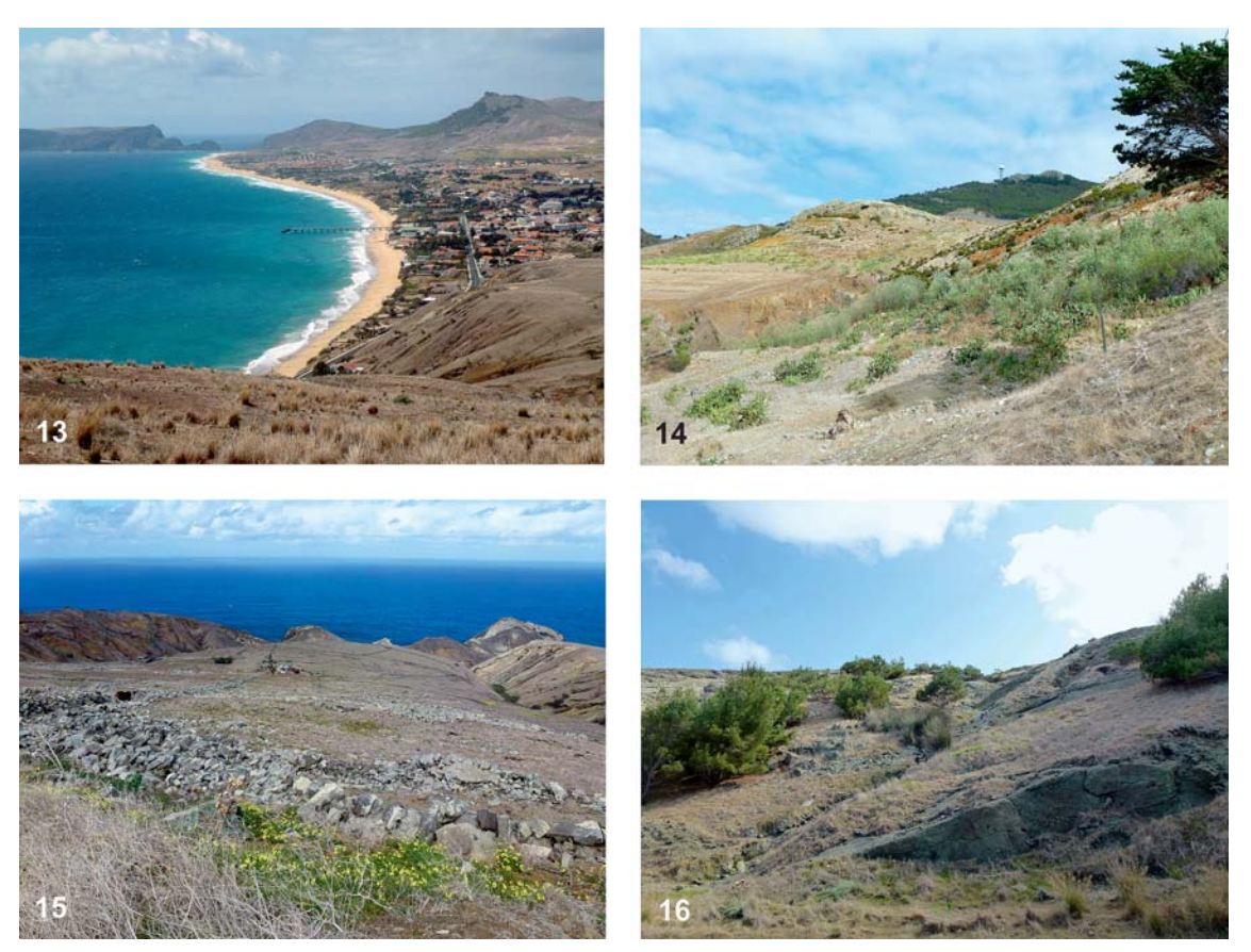
Fig. 13-16 : (13) South coast of Porto Santo with the stripe of the "golden" sand beach and the capital Vila Baleira. Three localities where A. dourada was detected: (14) ruderal site near Capela da Craça; (15) abandoned fields near Pedregal de Dentro; (16) dry rocky grassland at the base of Pico da Cabrita.