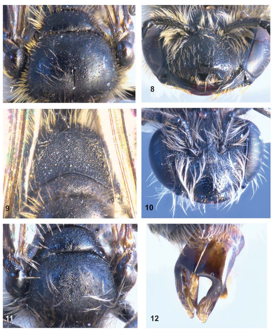
Fig. 7-12 : Andrena dourada nov.sp. (7) mesonotum, female; (8) labrum, female; (9); propodeum, female; (10) portrait of head, male; (11) mesonotum, scutellum, male; (12) male genital capsule.