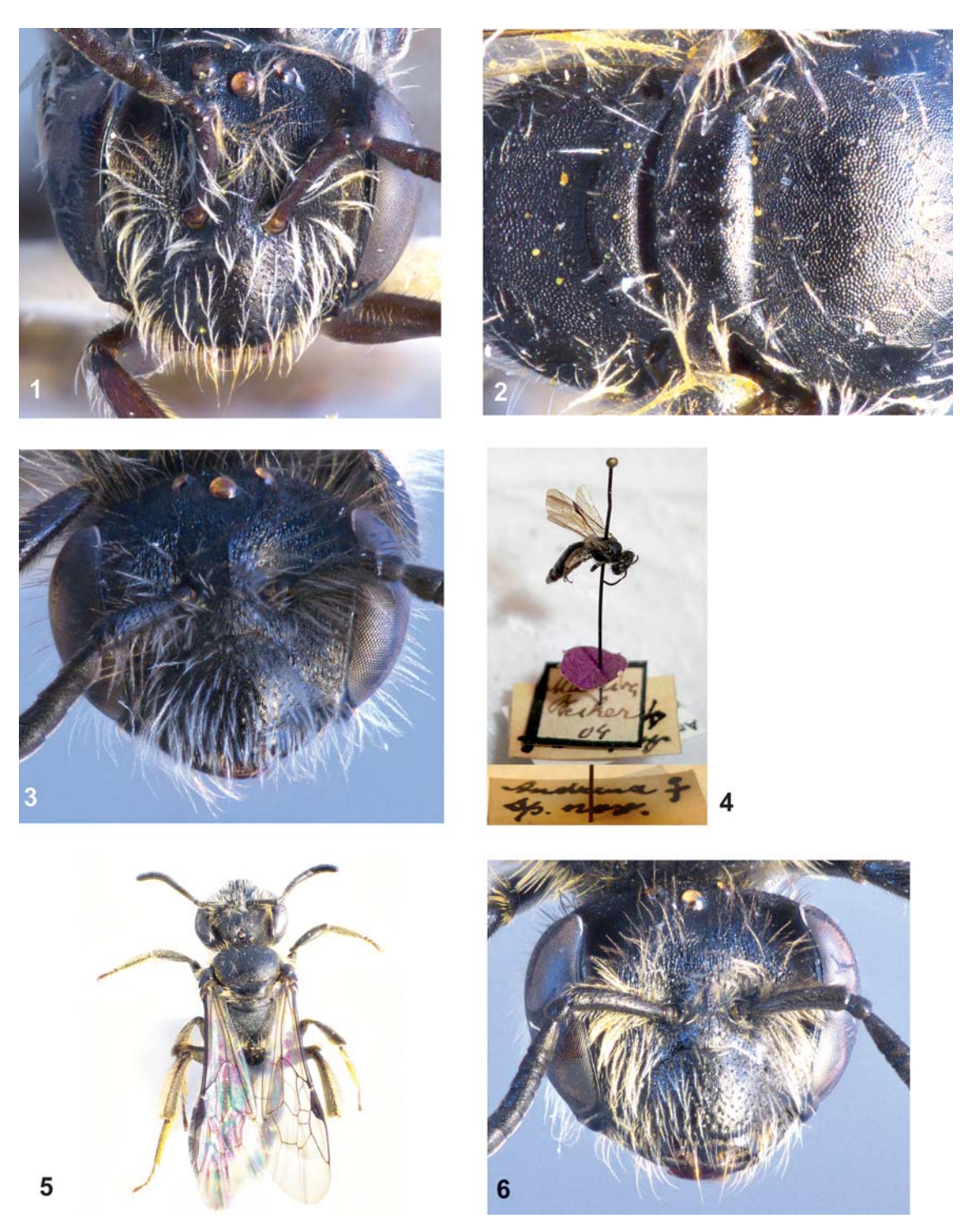
Fig. 1-6 : Andrena wollastoni (1) portrait of head, female; (2) mesonotum, scutellum, propodeum, female; (3) head, male; (4) male of Andrena wollastoni, collected by Becker 1904 and label "Andrena \varphi sp.nov."; Biology Centre of the Upper Austrian Provincial Museum Linz (Collection of Warncke); Andrena dourada nov.sp. (5) dorsal view, female; (6) head, female.