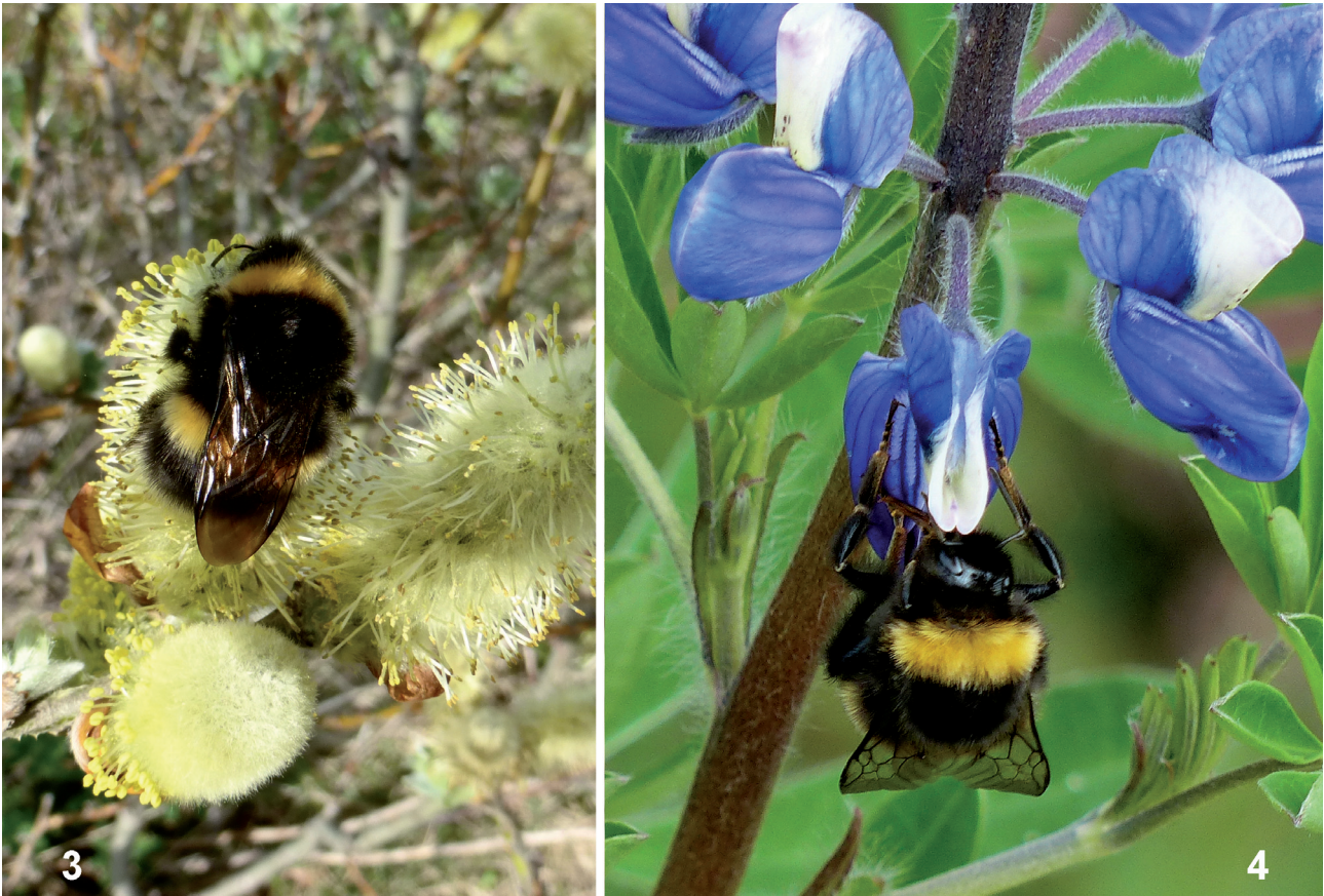
Figs. 3–4. Bombus lucorum queens visiting flowers in Iceland. – 3. Salix lanata (Bakkagerði, Höfn, 4.VI.2014). 4. Lupinus nootkatensis (Húsavík, Laxá, 8.VI.2014).

and snow. If we suppose that 177 grids are not ice- or permanently snow-covered, until today B. jonellus has been observed in 58 grids (33 %).