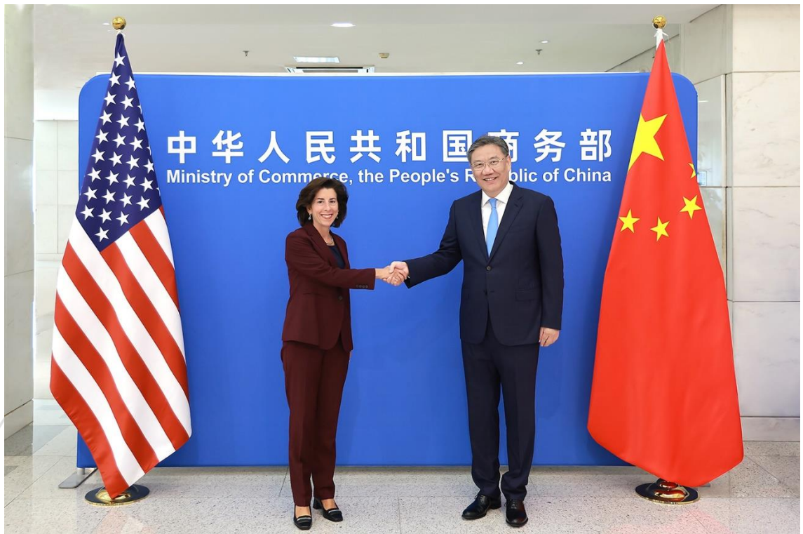
U.S. Commerce Secretary Gina Raimondo shakes hands with Chinese Commerce Minister Wang Wentao in Beijing, China, on August 28, 2023.