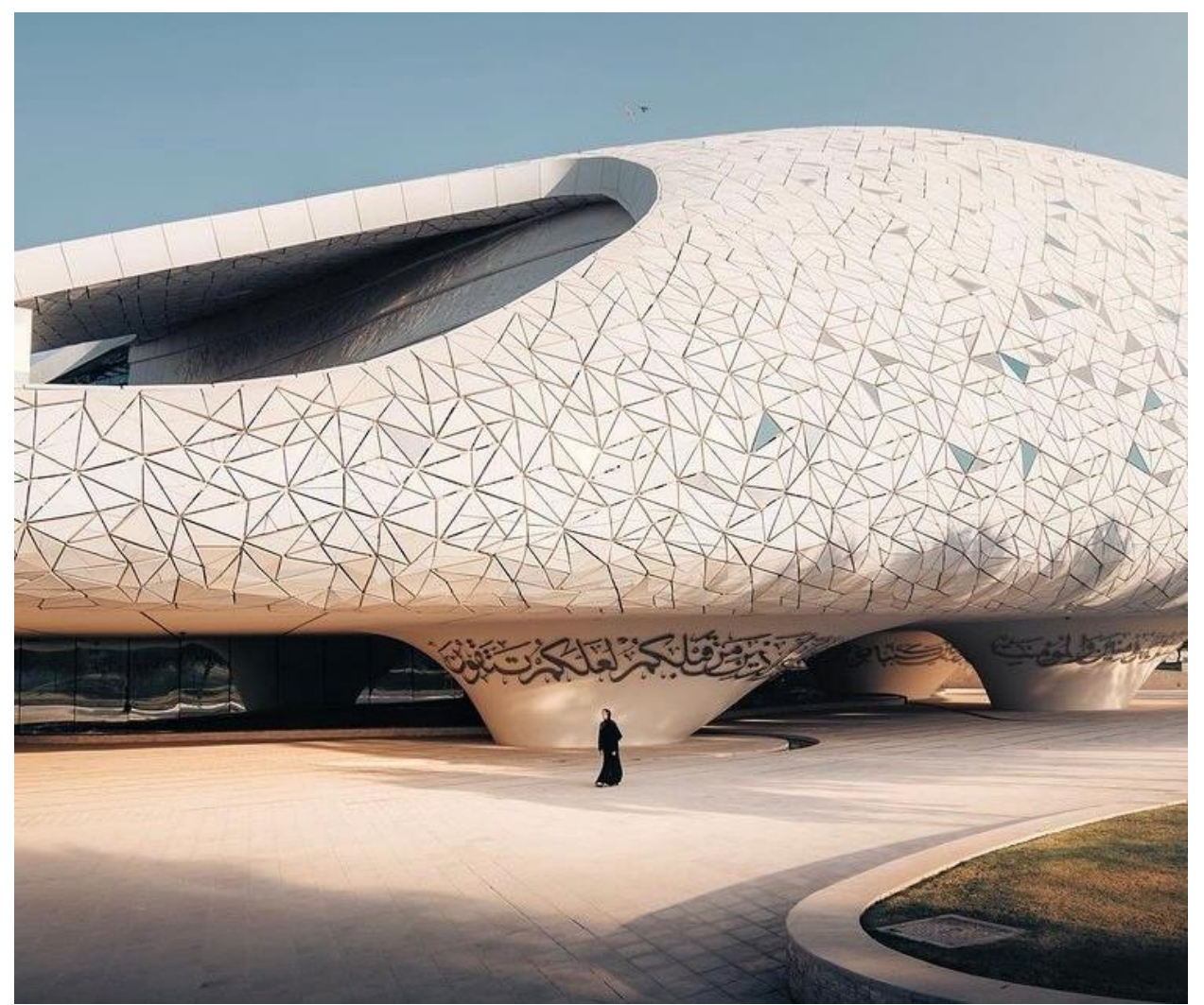
The Minaretein Center in Education City, The Qatar Faculty of Islamic Studies & Education City Mosque

modern inventions and technologies pertaining to artificial intelligence and environmental sustainability. The existence of this city and foundation is indispensable, standing as a symbol of youth empowerment, and the long-lasting impact on their futures. A branch of this foundation is known as Msheireb Properties, which focuses on ecologically friendly technology and sustainable real estate expansion. A recent addition to the city is Sidra Medicine, a research hospital with a specialty in women's and children's care.