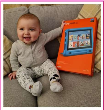
The tablet was huge help during Lockdown, when so few people could visit Archie.