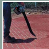
14. Remove debris with a mechanical blower or brush.