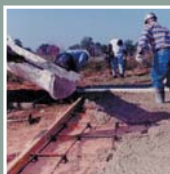
1. Place concrete as normal.