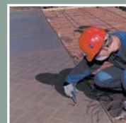
7. Trim field stencil to fit slab and/or soldier course.