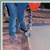
3. Stencil trimmed to fit slab.