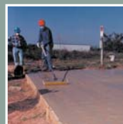
5. Slightly embed stencil with stencil roller.