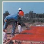
8. Broadcast permacolour colour hardener over the surface.