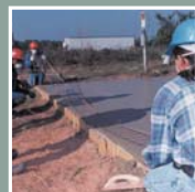
2. Soldier Course placed and slightly embedded with stencil roller.