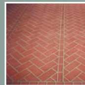
16. Finished application.