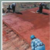
11. Apply desired finish (trowel, brush, roller, skin).