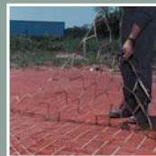
13. Stencil removal continues.