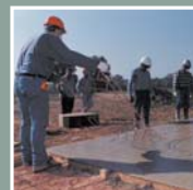
4. First course of stencil is placed.