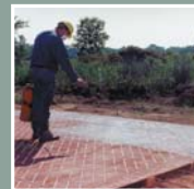
15. Apply Superseal Acrylic sealer.