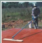
9. Float colour hardener into concrete.