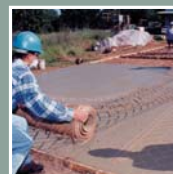
6. Second course of stencil placed (overlap leading and trailing edge mortar joints).