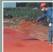
10. Apply extra colour hardener to light spots.