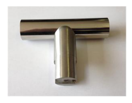
Fig. 1 Tube Connector fitted to tube, as seen from outside the shower.