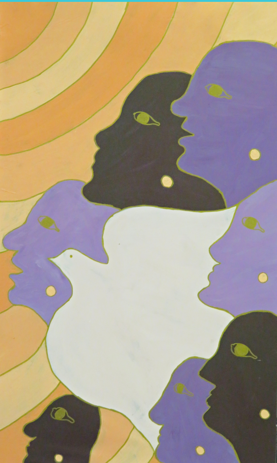
Art Work by Taneja Sheffey

"Working with the Sanctuary Project is actually what the name implies: it is a 'sanctuary' from the harshness of the world. Each time we join with our neighbors in Wilkinsburg for MLK Day, a COVID vaccine clinic, a day of service, a time of mourning, a conversation about the future...we are reminded that no matter how protective the building in which we meet might be, that protection pales in comparison with the sanctuary we give each other.