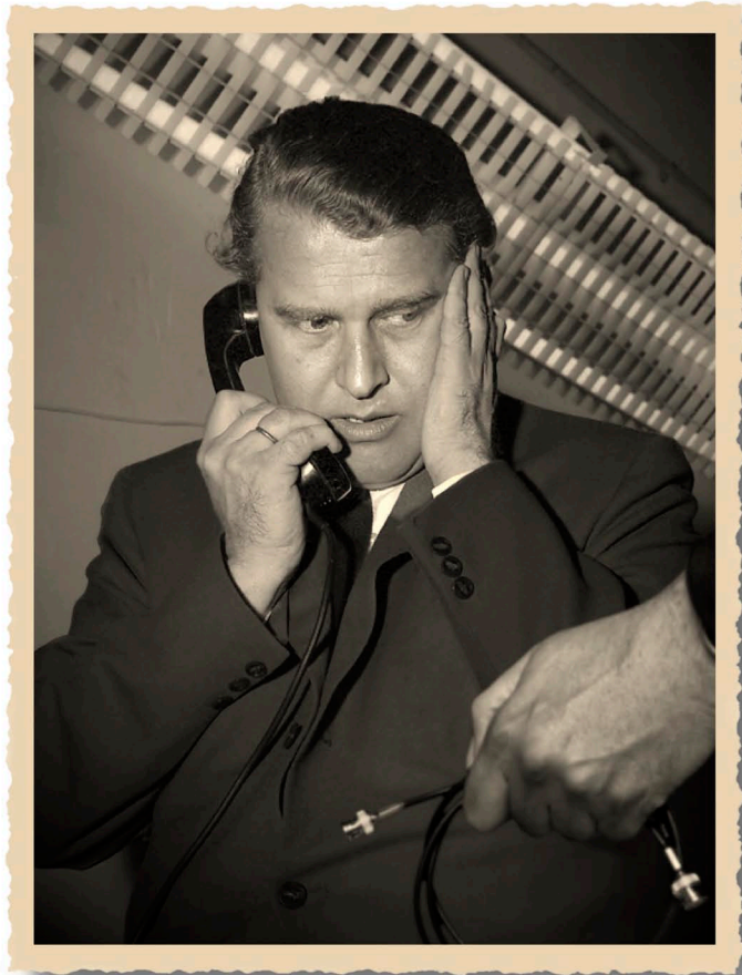
Wernher von Braun