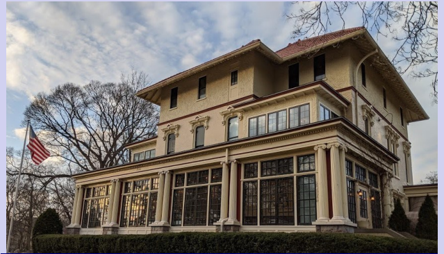
We met at Paddock Place in Grand Rapids just as COVID-19 was starting to appear in Michigan