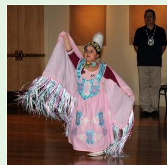
Attendees enjoyed the beautiful costumes and traditional Anishinabe dancing