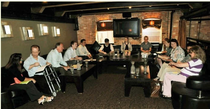
MISCC board meeting held before the membership meeting