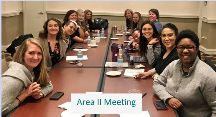
Area II Meeting