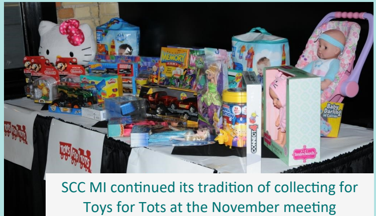
SCC MI continued its tradition of collecting for Toys for Tots at the November meeting