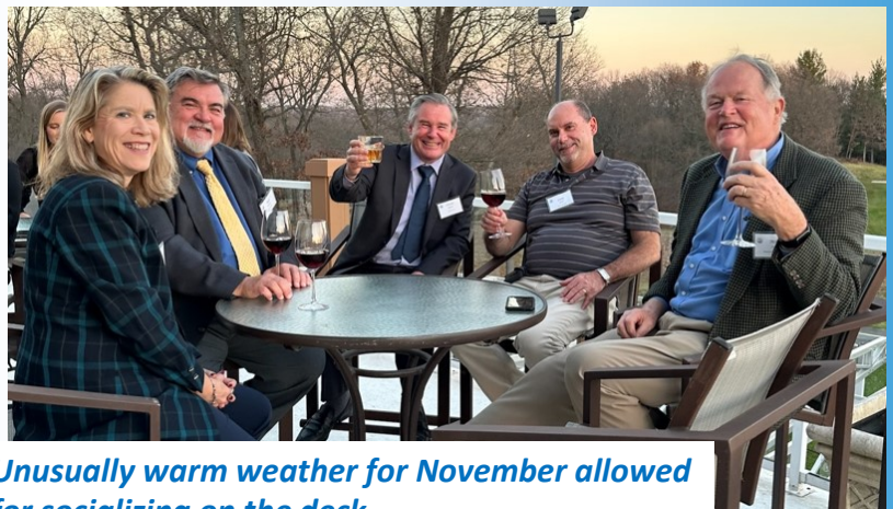
Unusually warm weather for November allowed for socializing on the deck