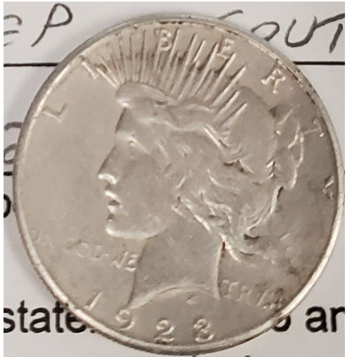
Coin Marty Drum Peace Dollar