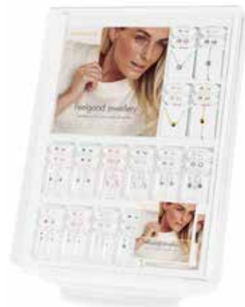
MINI FLAT DISPLAY, WHITE 15-001-1730 XXX B32 X H45 X D25 CM PRODUCT DISPLAY FOR SKIN FRIENDLY JEWELLERY. TO PLACE ON COUNTER OR HANG ON A WALL. ANTI THEFT MECHANISM WITH DOOR INCLUDED. EXCL. JEWELLERY.