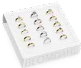
RING DISPLAY 15-001-1859 XXX B16 X H16 X D4 CM COUNTER DISPLAY FOR EXPOSURE OF SKIN FRIENDLY RINGS. EXCL. JEWELLERY.

NB! Gradually during the course of the year, the old logo on all products and accessories etc will be replaced with the new one.