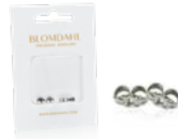
SKIN FRIENDLY EARRING BACKS FOR TITANIUM EARRINGS 15-1200-04-4 XXX 4 PCS/BLISTER REC. RETAIL PRICE XXX/BLISTER