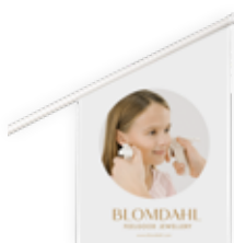
STREET FLAG – MEDICAL EAR PIERCING 306-0900 XXX 39,5 X 60 CM.