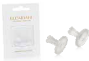
SKIN FRIENDLY EARRING BACKS FOR MEDICAL PLASTIC EARRINGS 15-0100-07-4 XXX 4 PCS/BLISTER REC. RETAIL PRICE XXX/BLISTER