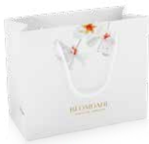
JEWELLERY GIFT BAG 310-0507 XXX/PCS B22 X H18 X D10 CM PUT EVERYTHING THAT THE CUSTOMER NEEDS: AFTERCARE INSTRUCTIONS, CLEANSING SWABS AND SKIN FRIENDLY JEWELLERY WITH JEWELLERY BOOKLET IN THIS NICE PAPER BAG.