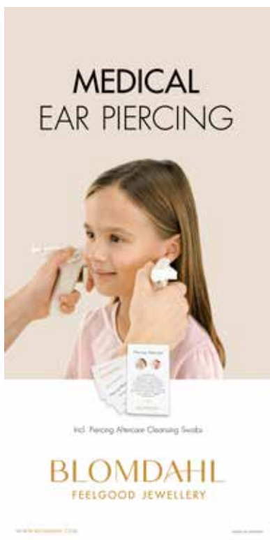
FABRIC BANNER: MEDICAL EAR PIERCING 50 X 100 CM 323-0106 XXX INCL HANGING DEVICE.