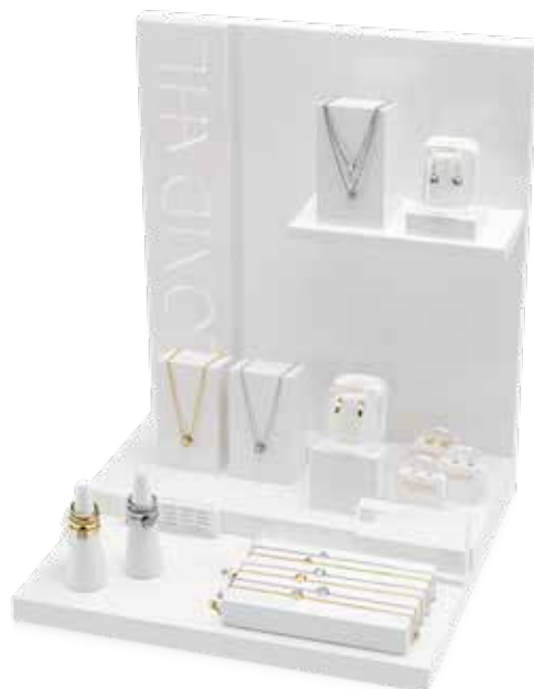
WINDOW DISPLAY, WHITE 15-001-1860 XXX B30 X H35 X D45/30 CM A COMPLETE "DISPLAY PACKAGE" FOR SINGLE OR DOUBLE PRODUCT DISPLAYING. EXCL. JEWELLERY.

NB! Gradually during the course of the year, the old logo on all products and accessories etc will be replaced with the new one.