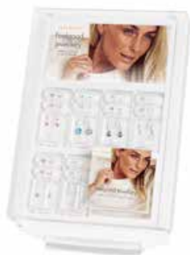
MICRO FLAT DISPLAY, WHITE 15-001-1780 XXX B23 X H35 X D18 CM PRODUCT DISPLAY FOR SKIN FRIENDLY JEWELLERY. TO PLACE ON COUNTER OR HANG ON A WALL. ANTI THEFT MECHANISM WITH DOOR INCLUDED. EXCL. JEWELLERY.