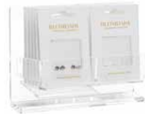
EARRING BACK HOLDER 15-001-1870 XXX B17 X H11 X D11 CM PLEXIGLASS HOLDER FOR EARRING BACKS.