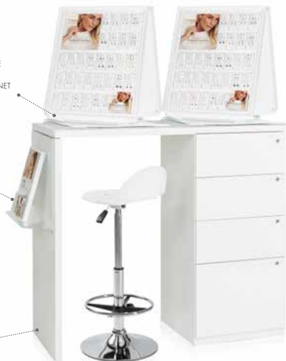
TABLE WHITE 503-0400 XXX B108 X D45 X H98 CM.

NB! Gradually during the course of the year, the old logo on all products and accessories etc will be replaced with the new one.