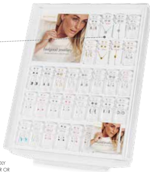
FLAT DISPLAY, WHITE 15-001-1750 XXX B42 X H55 X D28 CM PRODUCT DISPLAY FOR SKIN FRIENDLY JEWELLERY. TO PLACE ON COUNTER OR HANG ON A WALL. ANTI THEFT COVER WITH LOCKING MECHANISM INCLUDED. EXCL. JEWELLERY.

You can display the bracelets, necklaces and anklets in your existing flat display with the help of the inserts, on which you can easily mount the jewellery.