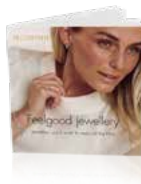
JEWELLERY BOOKLET 309-1006 XXX/25 PCS JEWELLERY BOOKLET WITH CONSUMER INFORMATION ABOUT SKIN FRIENDLY JEWELLERY. FITS INTO THE HOLDER ON THE PRODUCT DISPLAYS.