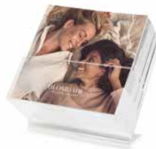
LOOKBOOK 309-1306-3 ASSORTMENT BOOKLET FOR SKIN FRIENDLY JEWELLERY WITH CONSUMER PRICES. CAN ONLY BE DOWNLOADED FROM THE MEDIA STORE.