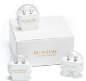
JEWELLERY GIFT BOX 310-0307 XXX/PCS 10 X 10 X 5 CM GIFT BOX FOR SKIN FRIENDLY EARRINGS AND NOSE JEWELLERY.

NB! Gradually during the course of the year, the old logo on all products and accessories etc will be replaced with the new one.