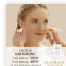
SIGN FOR SELECTION DISPLAY 12-002-406 XXX