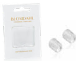
SKIN FRIENDLY STOPPERS FOR EAR PENDANTS AND SAFETY EAR HOOKS 15-0100-06-4 XXX 4 PCS/BLISTER REC. RETAIL PRICE XXX/BLISTER