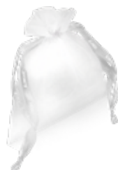
JEWELLERY GIFT POUCH 310-0407 XXX/10 PCS 16 X 20 CM GIFT POUCH FOR SKIN FRIENDLY EARRINGS AND NOSE JEWELLERY.