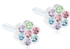
PURE MEDICAL PLASTIC – 0 % NICKEL

It's faster, feels safer and is gentler for the child.