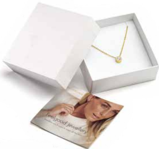
JEWELLERY BOX 310-0207 XXX/PCS 9 X 9 X 3 CM GIFT BOX FOR SKIN FRIENDLY BRACELETS, NECKLACES, RINGS AND ANKLETS.