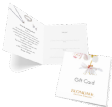
GIFT CARD 309-0206 GIFT CARD FOR SKIN FRIENDLY JEWELLERY OR MEDICAL EAR OR NOSE PIERCING. CAN ONLY BE DOWNLOADED FROM THE MEDIA STORE.