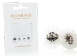
SKIN FRIENDLY EARRING BACKS WITH DISC FOR TITANIUM EARRINGS 15-1200-08-4 XXX 4 PCS/BLISTER REC. RETAIL PRICE XXX/BLISTER