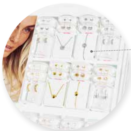
INSERT BRACELET/ANKLET FOR DISPLAY 15-001-1700-2 XXX INSERT NECKLACE FOR DISPLAY 15-001-1700-3 XXX

You can display the bracelets, necklaces and anklets in your existing flat display with the help of the inserts, on which you can easily mount the jewellery.