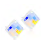
FACET SQUARE RAINBOW 15-0187-02, 10 MM C