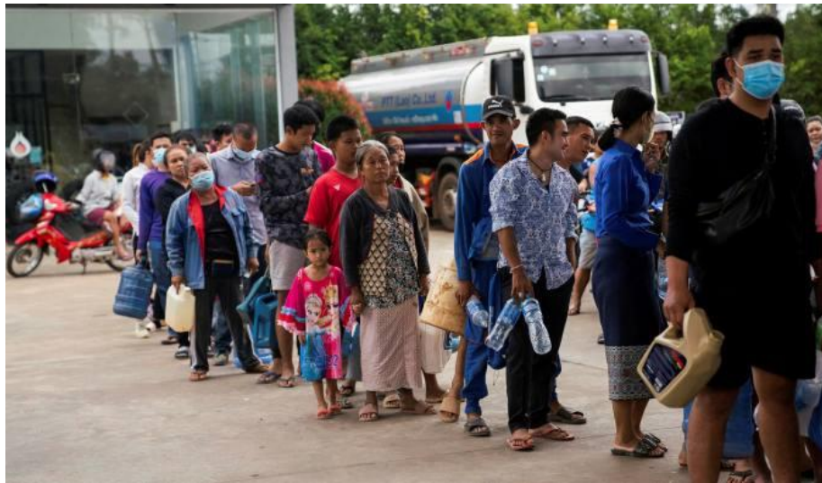
People line up at a petrol station in Laos, May 2022, as inflation increases scarcity of essential commodities including fuel.