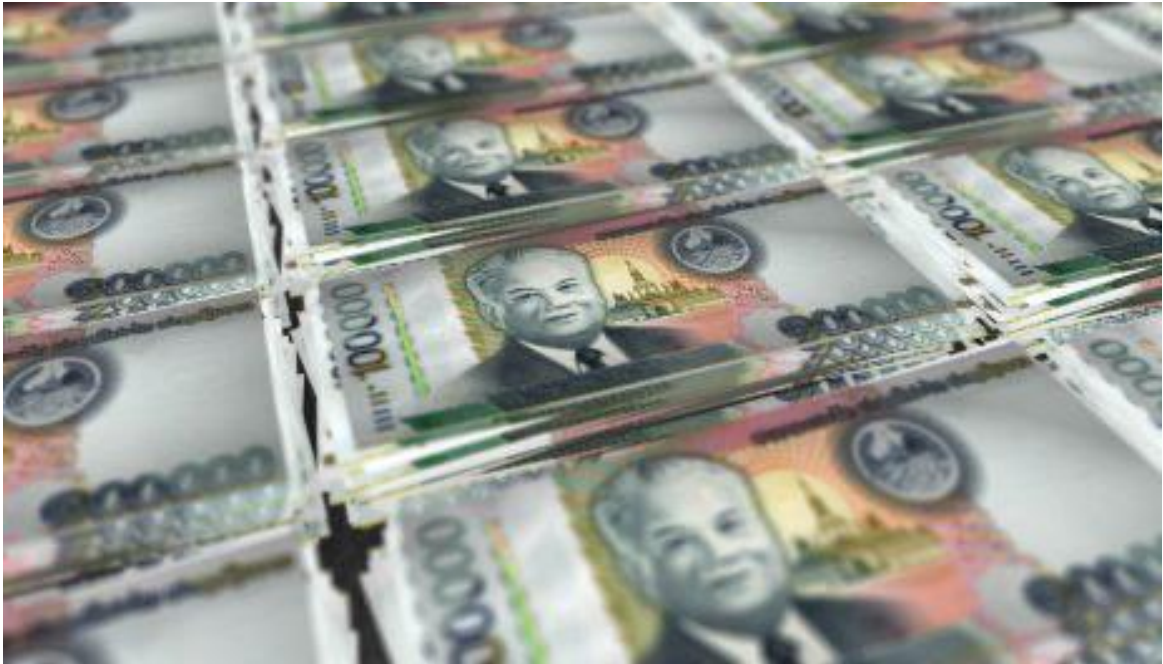
Laos' currency, the Lao Kip.