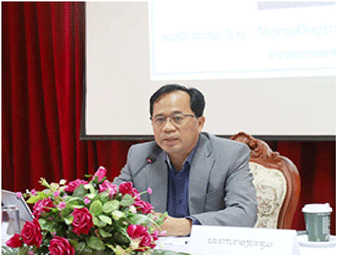
Bonleua Sinxayvoravong, Laos' newly appointed Bank of Laos Governor.

replaced with former deputy finance minister Bonleua Sinxayvoravong. The autocratic government has now begun to realize how dire the situation is and they are trying to mitigate the public reaction ever since a major public outcry online in June. Since the country is run by a one-party state with very limited freedom of press, speech, and dissent, the Government has not been entirely transparent with the public about the extremity of the nation's economic situation. Nishizawa says that the government is only releasing selective information so as not to alarm the public and potentially spark protests.