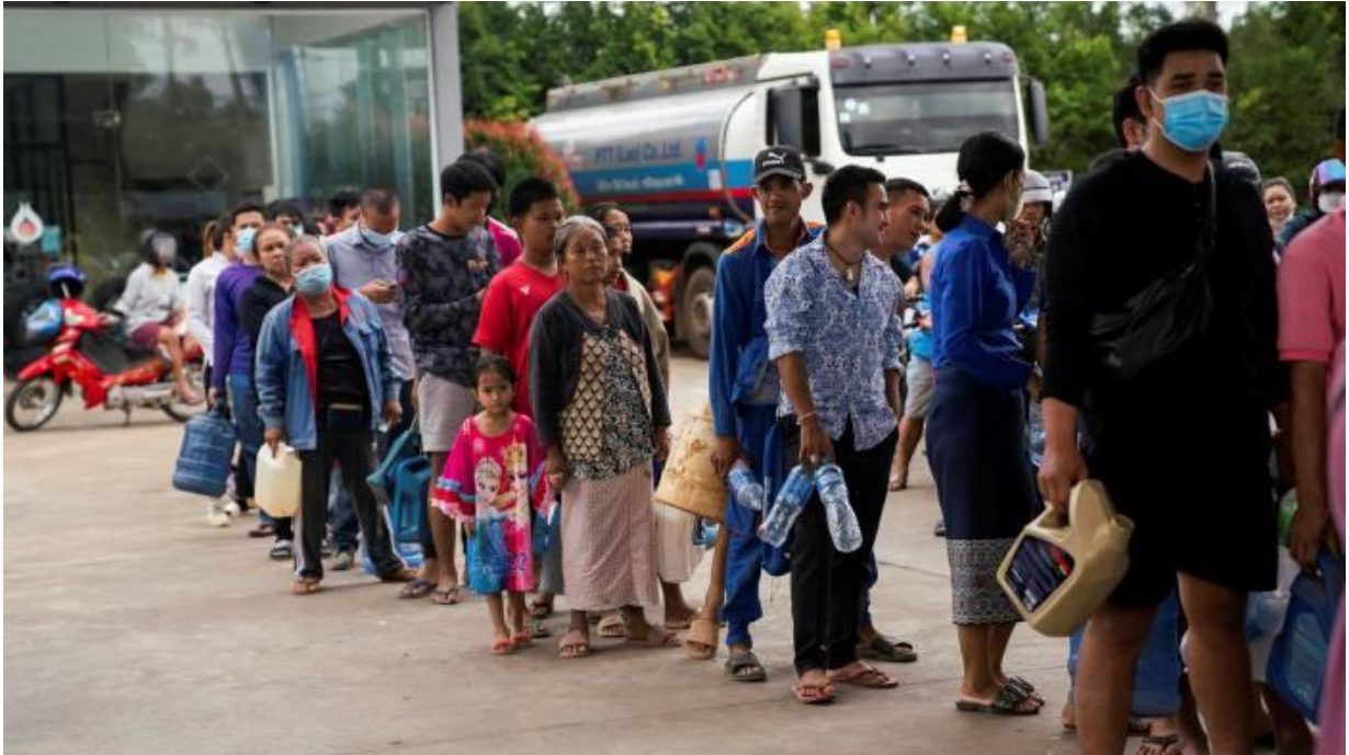
People line up at a petrol station in Laos, May 2022, as inflation increases scarcity of essential commodities including fuel.

Laos is a small, landlocked country located in Southeast Asia. It is home to about seven million people and is run by a one-party Communist rule. It is one of the few remaining Communist countries in the world. Like many countries over the last few months Laos has been dealing with record high inflation and rising gas and energy prices. The current inflation rate in the country is 12.8%, the highest in 18 years. The war in Ukraine and the continued economic fallout from the Covid-19 Pandemic has sent prices of everyday items, such as groceries and gasoline, surging. Laos had been facing grave financial issues even before the recent global crises. Their foreign currency reserves have depreciated to only 1.4 billion dollars compared to the average of 110 billion dollars in most other nations. Their debt payments per year until 2025 are supposed to be 1.3 billion dollars, which is almost the entire amount of their current foreign reserves. They also have an extremely high foreign debt, owed mostly to China, and their currency, the Lao Kip, is currently collapsing in value against the U.S dollar. It has lost 36% of its value against the dollar. Laos' foreign debt has amounted to 14 billion dollars and the World Bank estimates that about half of that is owed to the Chinese. Laos is currently one of the most deeply indebted countries in Asia as well as one of the poorest.