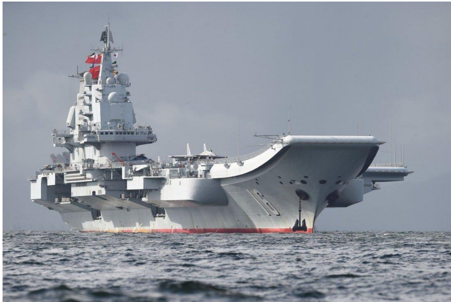
Chinese Aircraft Carrier near Taiwan