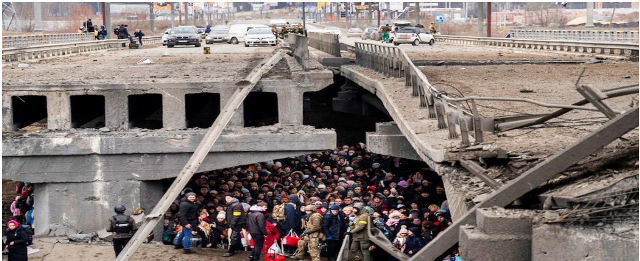
The bridge over the Irpin River, near Kyiv, destroyed by a Russian air strike.

In the face of such onslaught, President Volodymyr Zelensky has braved all types of intimidation from Russia, despite his name and members of his Government being on a Russian hit list. He decided to remain in Kyiv and defend his nation. Zelensky, an actor turned President, who just months ago was increasingly unpopular, has become the hero of Ukraine, inspiring millions of its citizenry to face all odds and defend their country. This conflict has created more than 1.5 million Ukrainian refugees to date and the number of refugees will increase exponentially, as many have fled to Poland, Slovakia, and Romania.