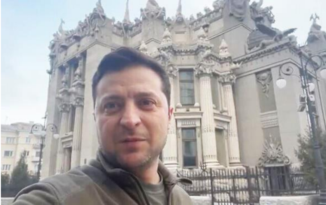
President Zelensky takes a selfie in Kyiv after deciding to stay and defend the city.

In the face of such onslaught, President Volodymyr Zelensky has braved all types of intimidation from Russia, despite his name and members of his Government being on a Russian hit list. He decided to remain in Kyiv and defend his nation. Zelensky, an actor turned President, who just months ago was increasingly unpopular, has become the hero of Ukraine, inspiring millions of its citizenry to face all odds and defend their country. This conflict has created more than 1.5 million Ukrainian refugees to date and the number of refugees will increase exponentially, as many have fled to Poland, Slovakia, and Romania.