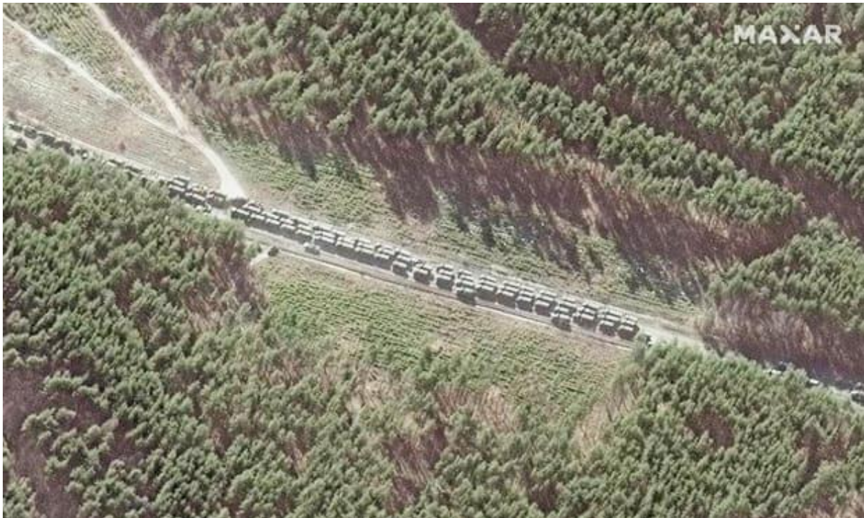
A section of a Russian convoy, Rudnya-Shpylivska, north of Kyiv.

Putin and his rubber-stamped Duma, which he populated and cloned with his sycophants, all the while stealing democracy and robbing the Russian people of any sort of choice while crushing a democratic opposition and silencing an independent press in Russia. The sad reality is that a free Ukraine was not a threat because it would join NATO or become a future missile base; for there were no such immediate plans for its acceptance in NATO, nor were there ever plans for any future missile base. A free Ukraine threatened Russia, Belarus, and Putin’s state of kleptocracy and KGB democracy, the Party of ‘Crooks and Thieves,’ simply because it offered people an alternative, an example of freedom, like West and East Germany.