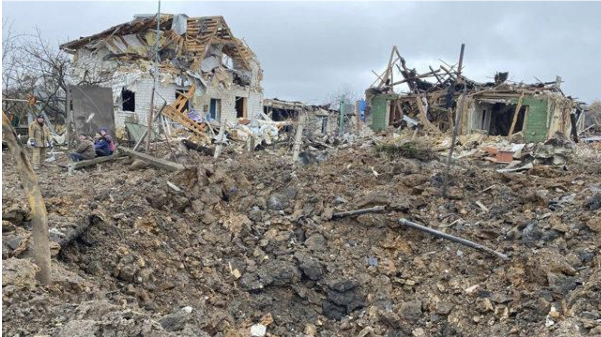
Russian invaders fired from the air at the village of Yakovlevka, Merefyansky community, Kharkov region.