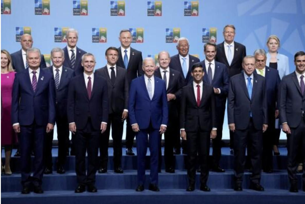
NATO heads of state and government pose during a group photo at a NATO summit in Vilnius, Lithuania. July 11 th , 2023. 1