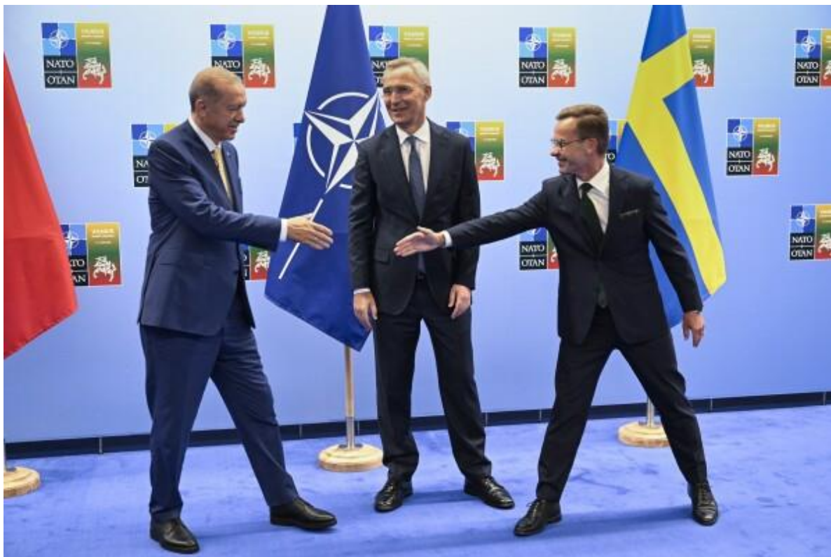
Turkish President Tayyip Erdogan, left, and Swedish Prime Minister Ulf Kristersson shake hands next to NATO Secretary-General Jens Stoltenberg prior to their meeting, on the eve of the NATO summit, in Vilnius, Monday, July 10 th, 2023. 9

The conversation between Sweden's Prime Minister, Ulf Kristersson, and Turkey's President, Tayyip Erdoğan, surprised everyone before the 2023 NATO Summit. A statement by Kristersson following the meeting discussed the agreement between the two countries, in which President Erdoğan committed to moving forward with the ratification of Sweden to NATO. 8 Sweden reaffirmed their commitments with the trilateral memorandum agreement made at the 2022 NATO Summit in Madrid. Additionally, Sweden agreed to establish a new security dialogue, deepen its cooperation on trade and investments, and strengthen the talks of Turkey's accession to the European Union. There also were talks about improving customs arrangements and taking steps to implement visa-free European travel for Turkish citizens to Sweden.