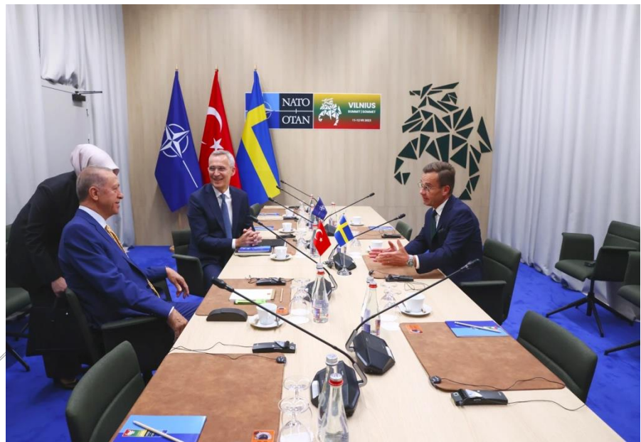
NATO Secretary General Jens Stoltenberg, center, speaks with Turkey's President Recep Tayyip Erdogan, left, and Sweden's Prime Minister Ulf Kristersson during a meeting ahead of a NATO summit in Vilnius, Lithuania, Monday, July 10, 2023.